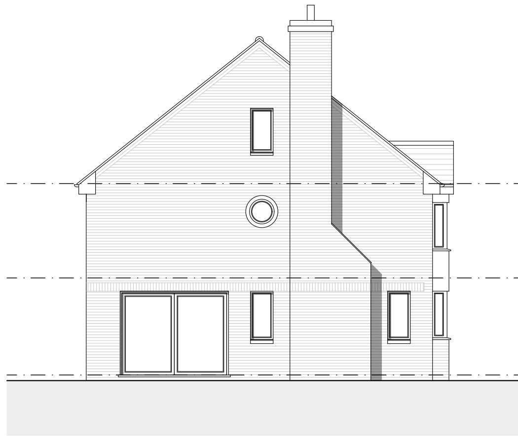
EXISTING FLANK ELEVATION 1:100