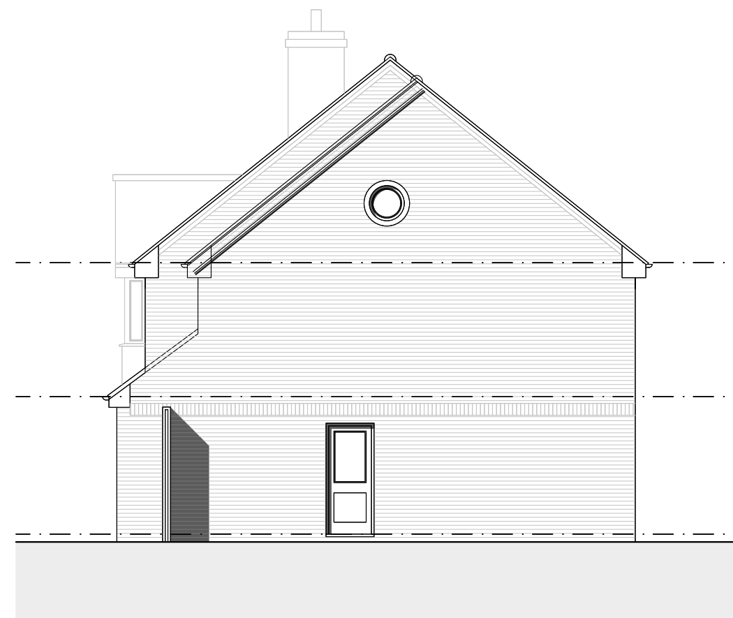
EXISTING FLANK ELEVATION 1:100