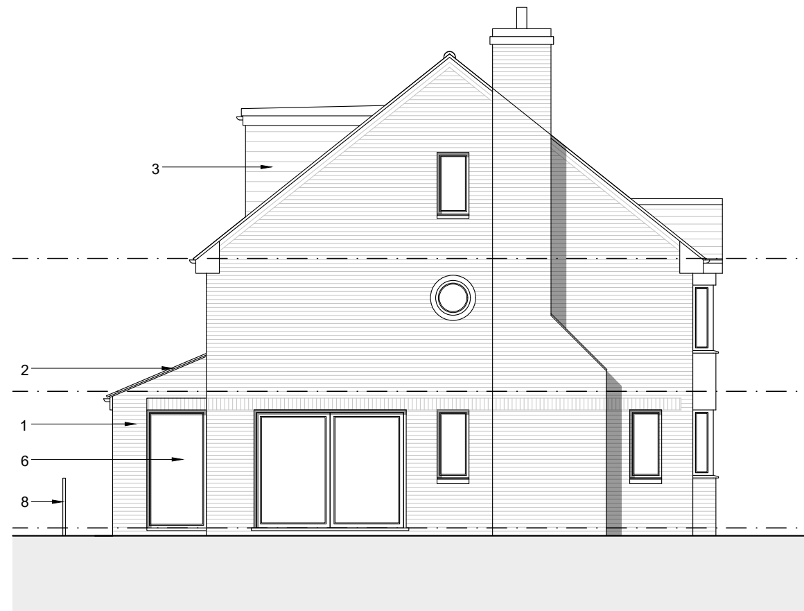
PROPOSED FLANK ELEVATION 1:100