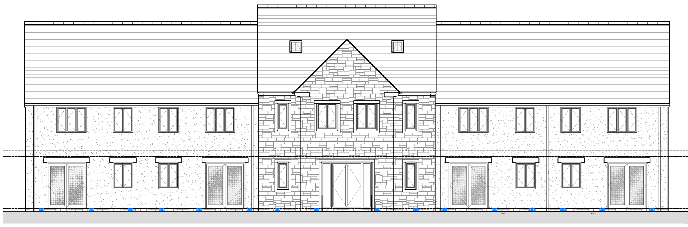
PLOT 41 PLOT 40 PLOT 39 PLOT 38 PLOT 37 South Elevation