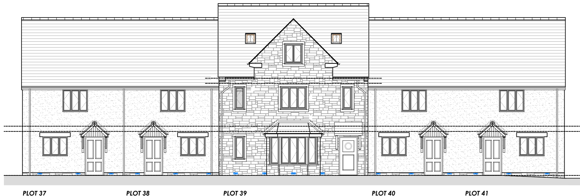
PLOT 37 PLOT 38 PLOT 39 PLOT 40 PLOT 41 North Elevation