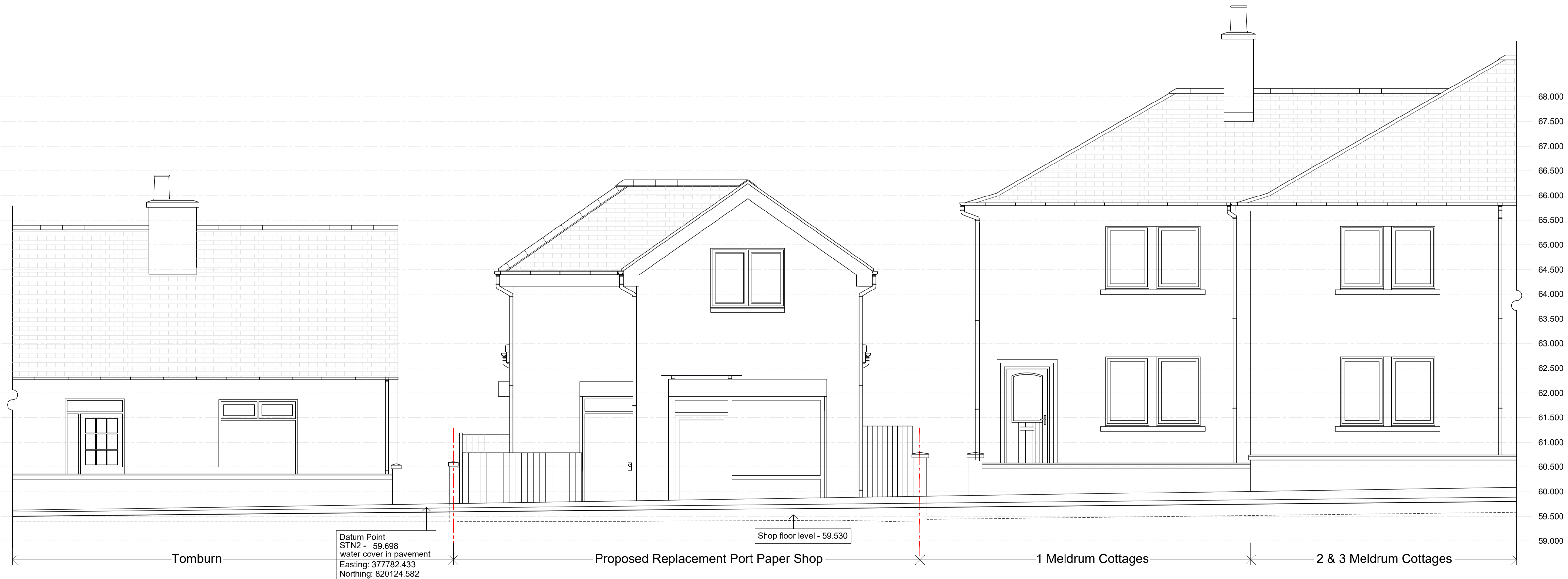
Proposed Elevation to Elphinstone Road

LEVELS: *Note: As well as datum point/survey station all survey levels are related to Ordnance Survey using GPS. Refer to drawing no. D99-31 for site levels as well as Cameron + Ross drg. no. 220747-000-CAM-DR-G-001 for topographical survey