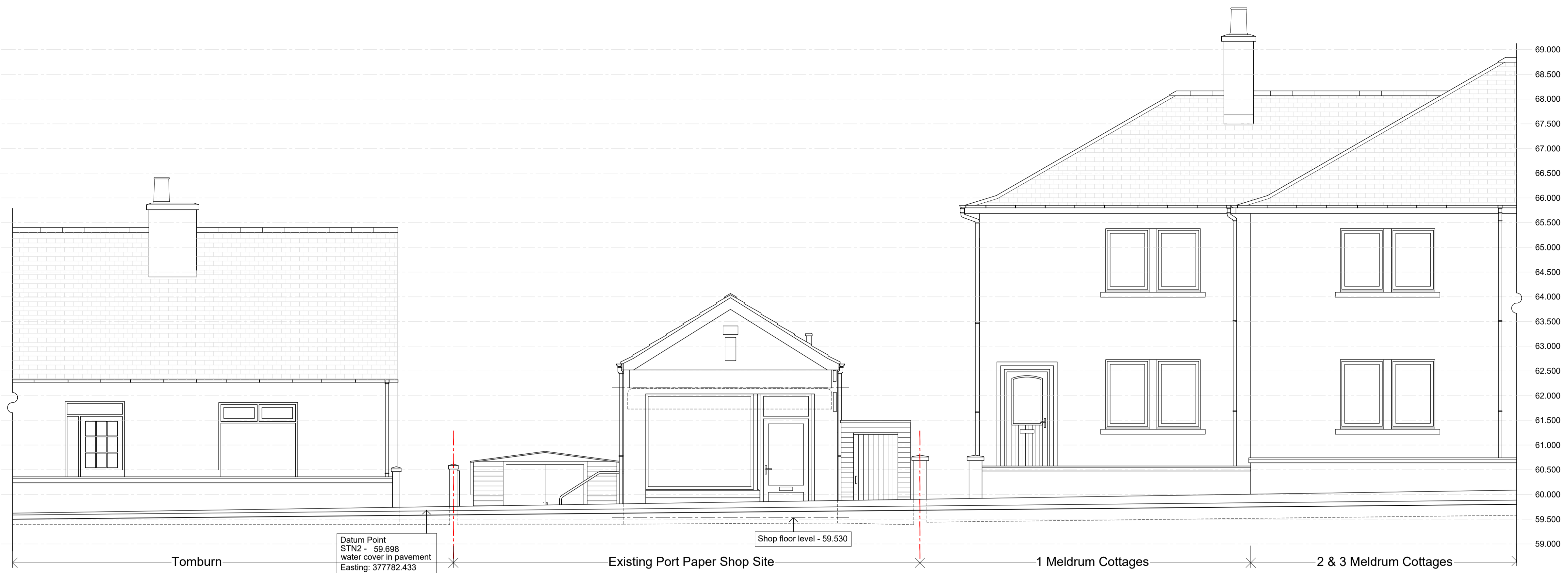
Existing Elevation to Elphinstone Road

LEVELS: *Note: As well as datum point/survey station all survey levels are related to Ordnance Survey using GPS. Refer to drawing no. D99-31 for site levels as well as Cameron + Ross drg. no. 220747-000-CAM-DR-G-001 for topographical survey