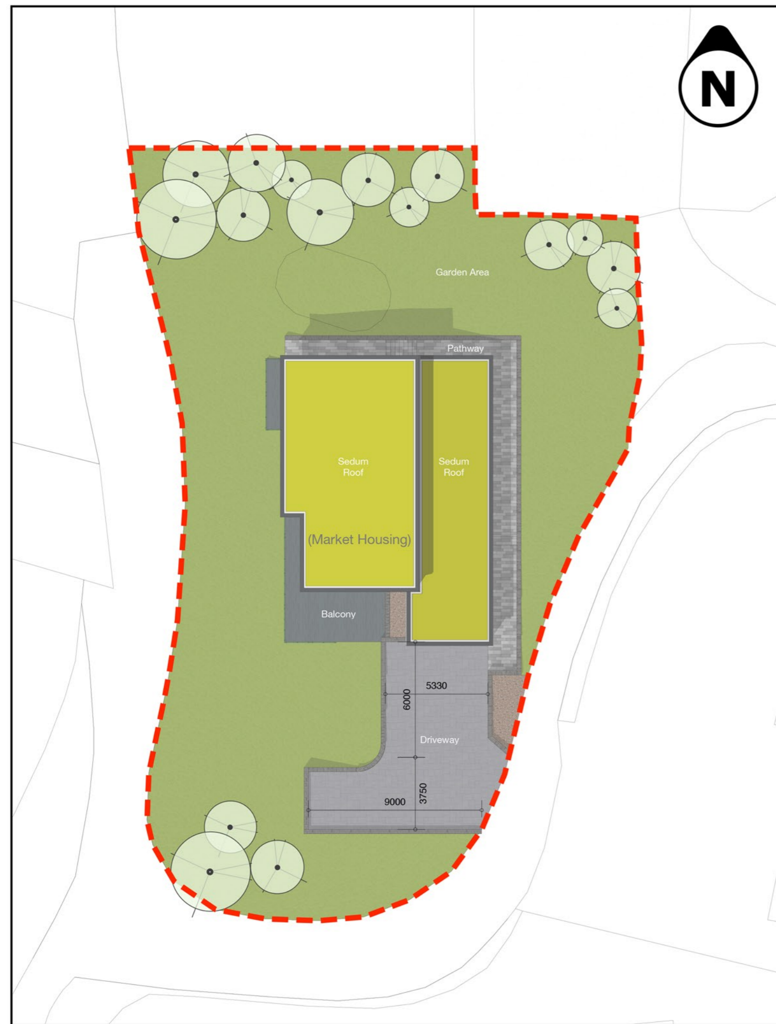
Site Plan - Proposed scale 1:200