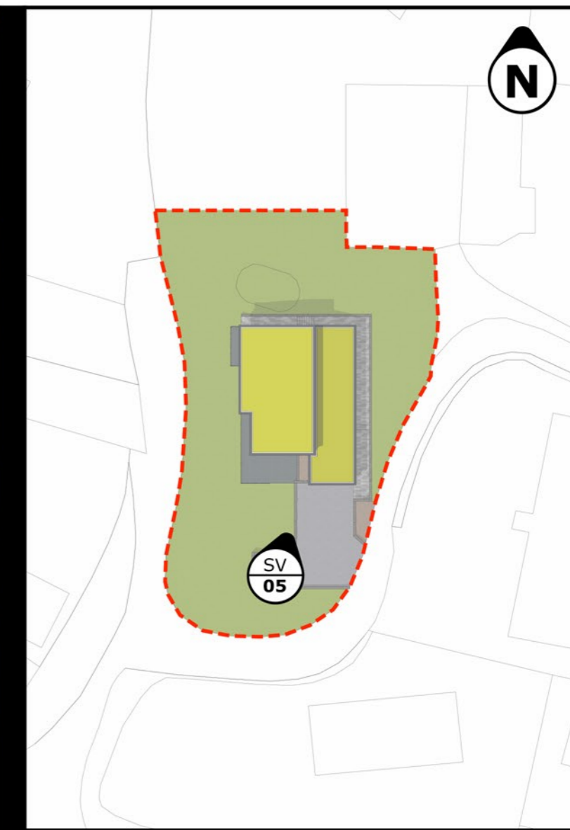
Site Visual 05 - Proposed scale NTS