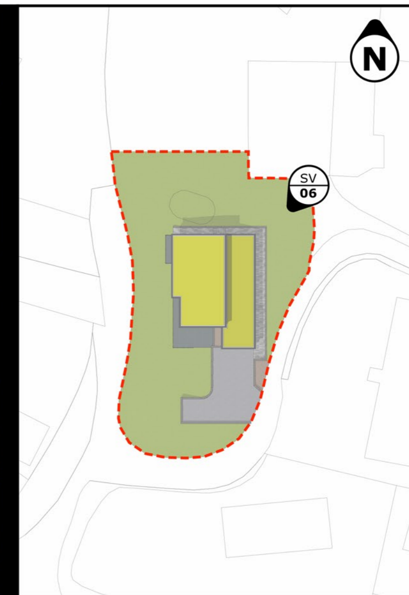
Site Visual 06 - Proposed scale NTS