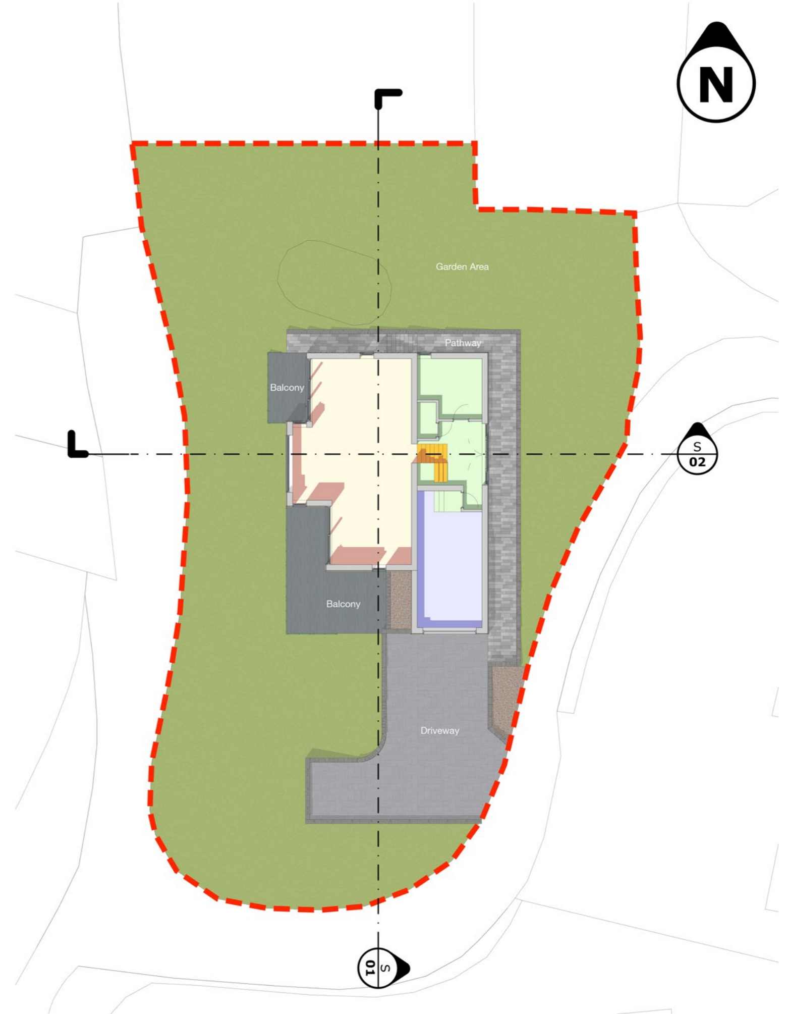
Section Site Plan - Proposed scale 1:200