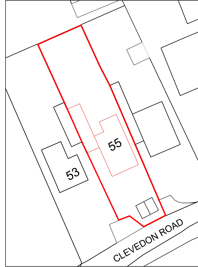
1:500 BLOCK PLAN