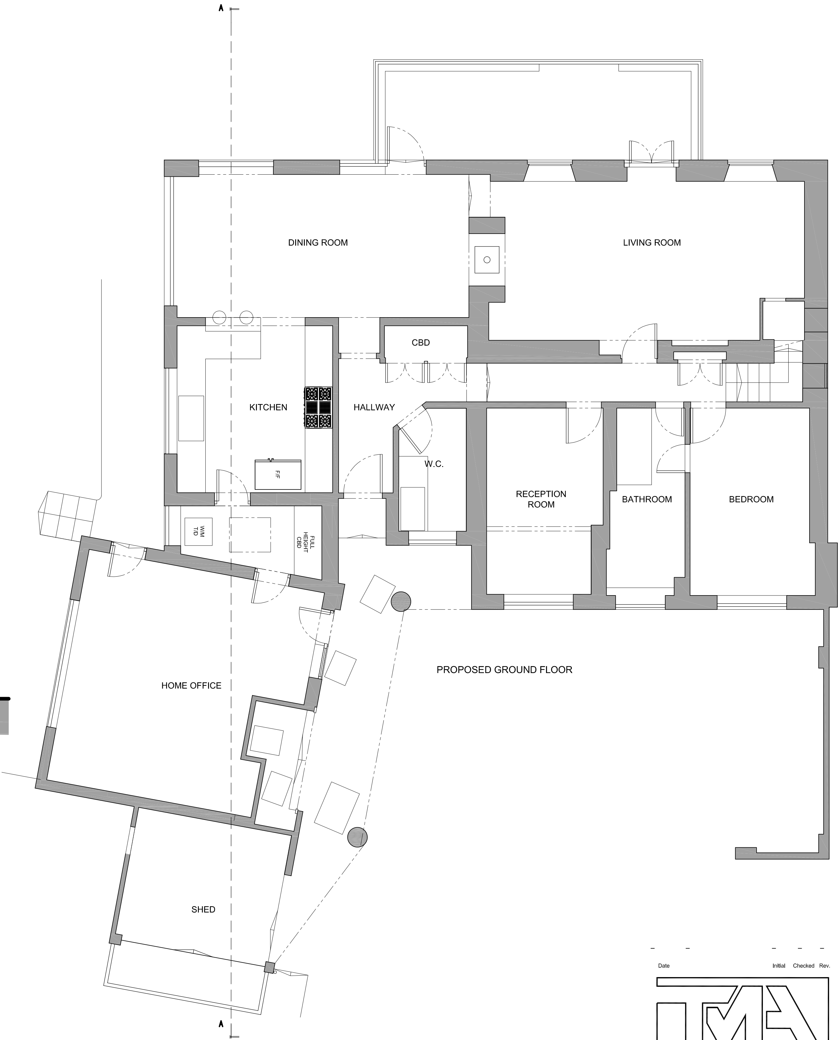
PROPOSED GROUND FLOOR