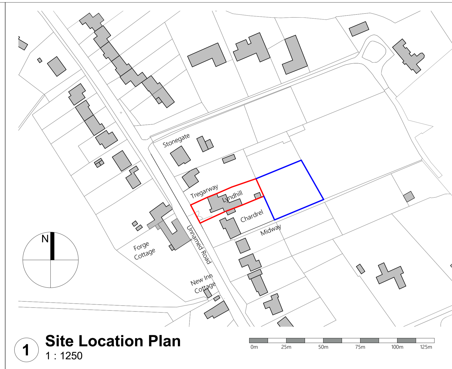
1 Site Location Plan 1 : 1250