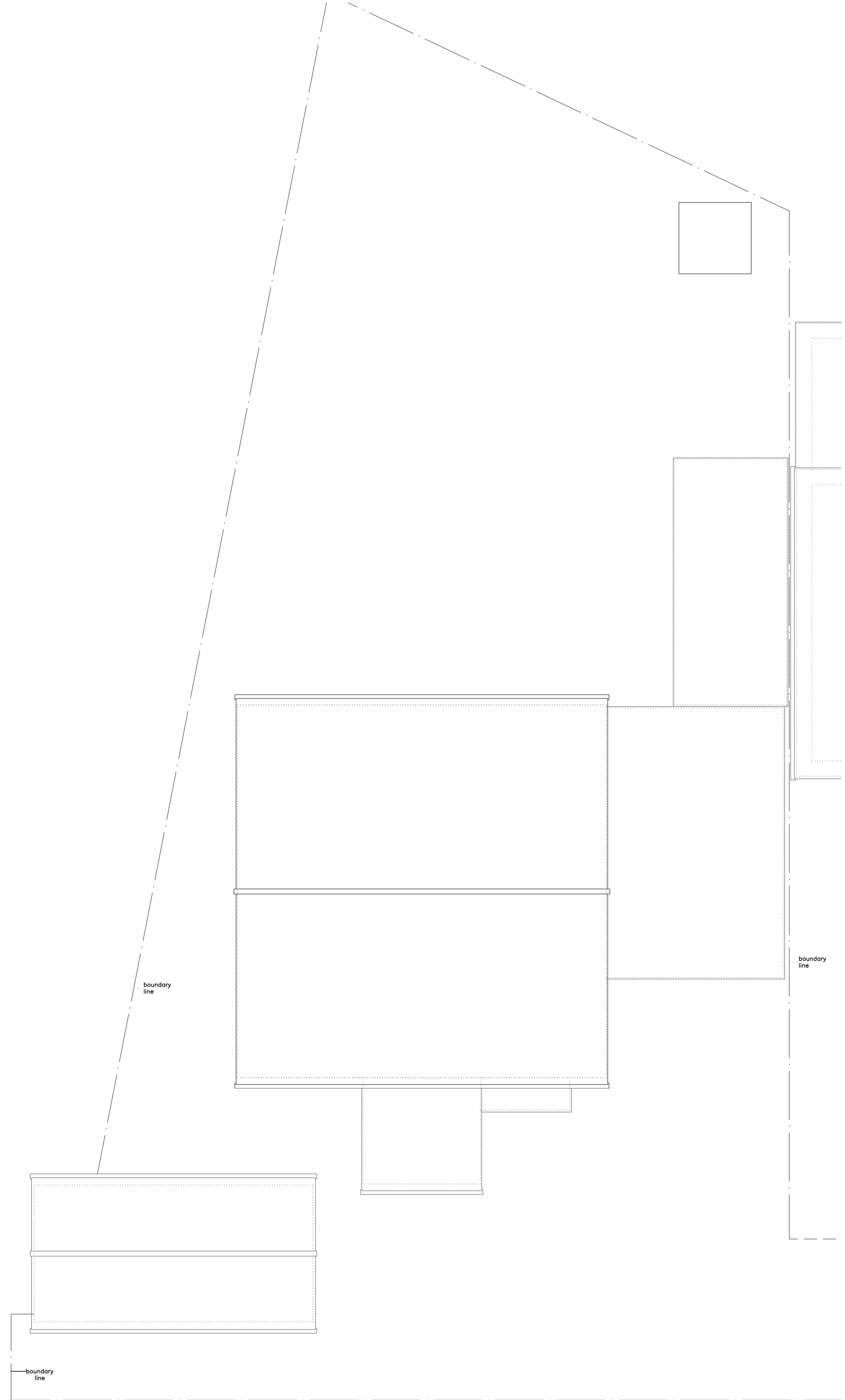
roof plan scale 1:50