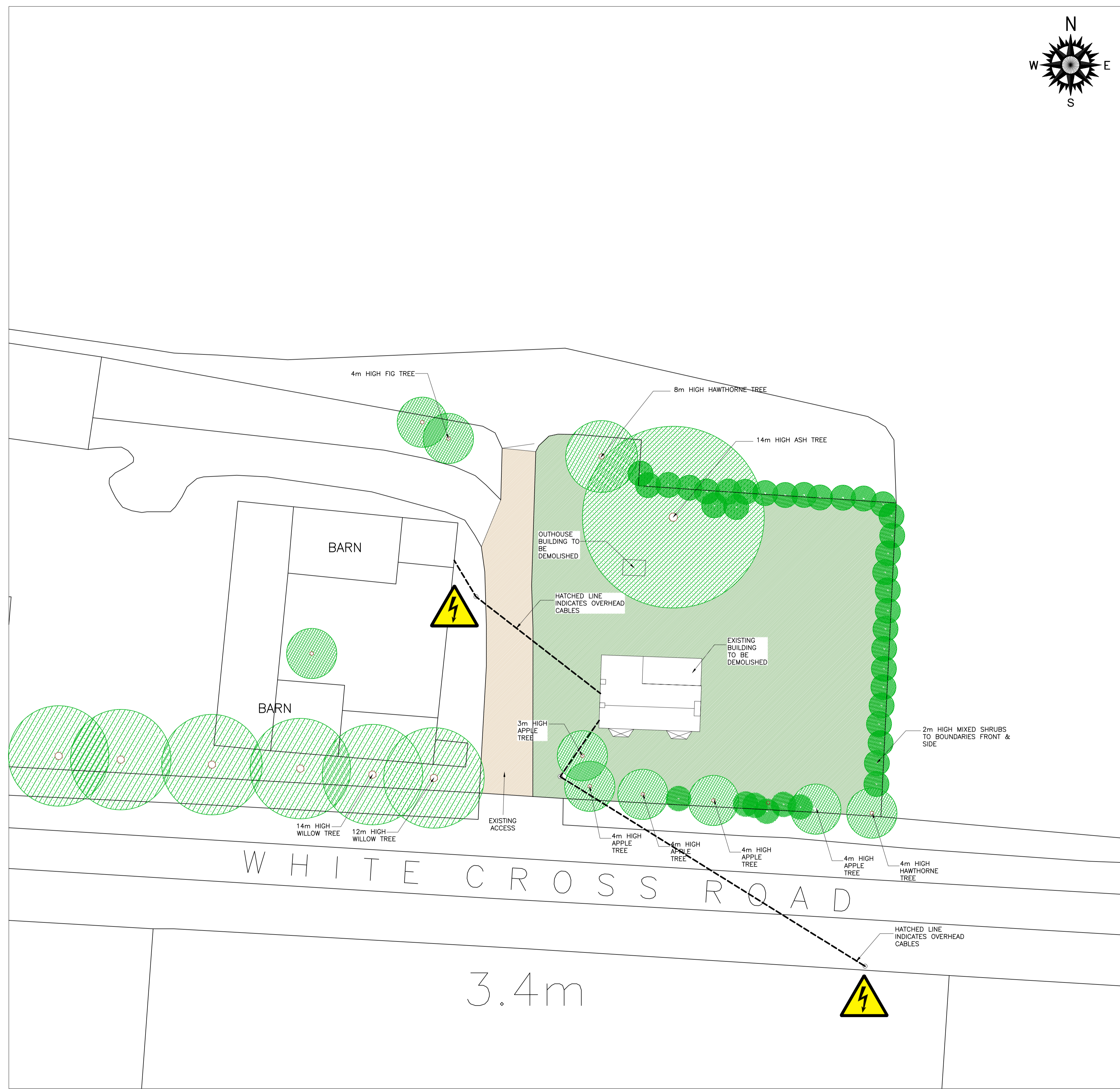
EXISTING SITE PLAN (1:200)