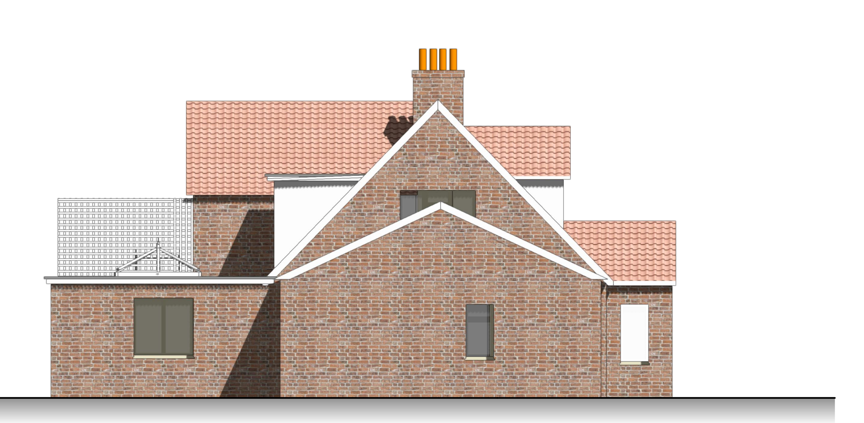
SOUTH ELEVATION 1:50