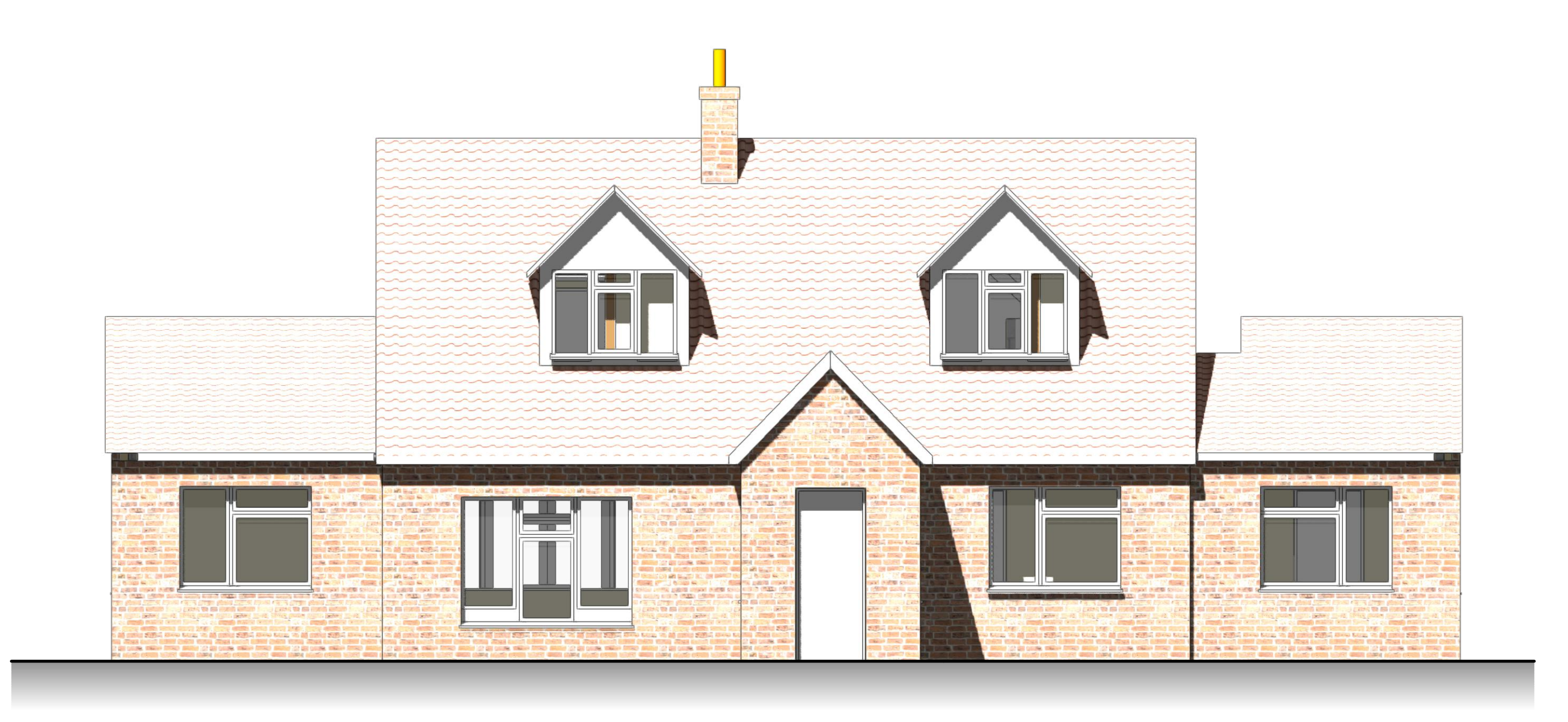
EAST ELEVATION 1:50