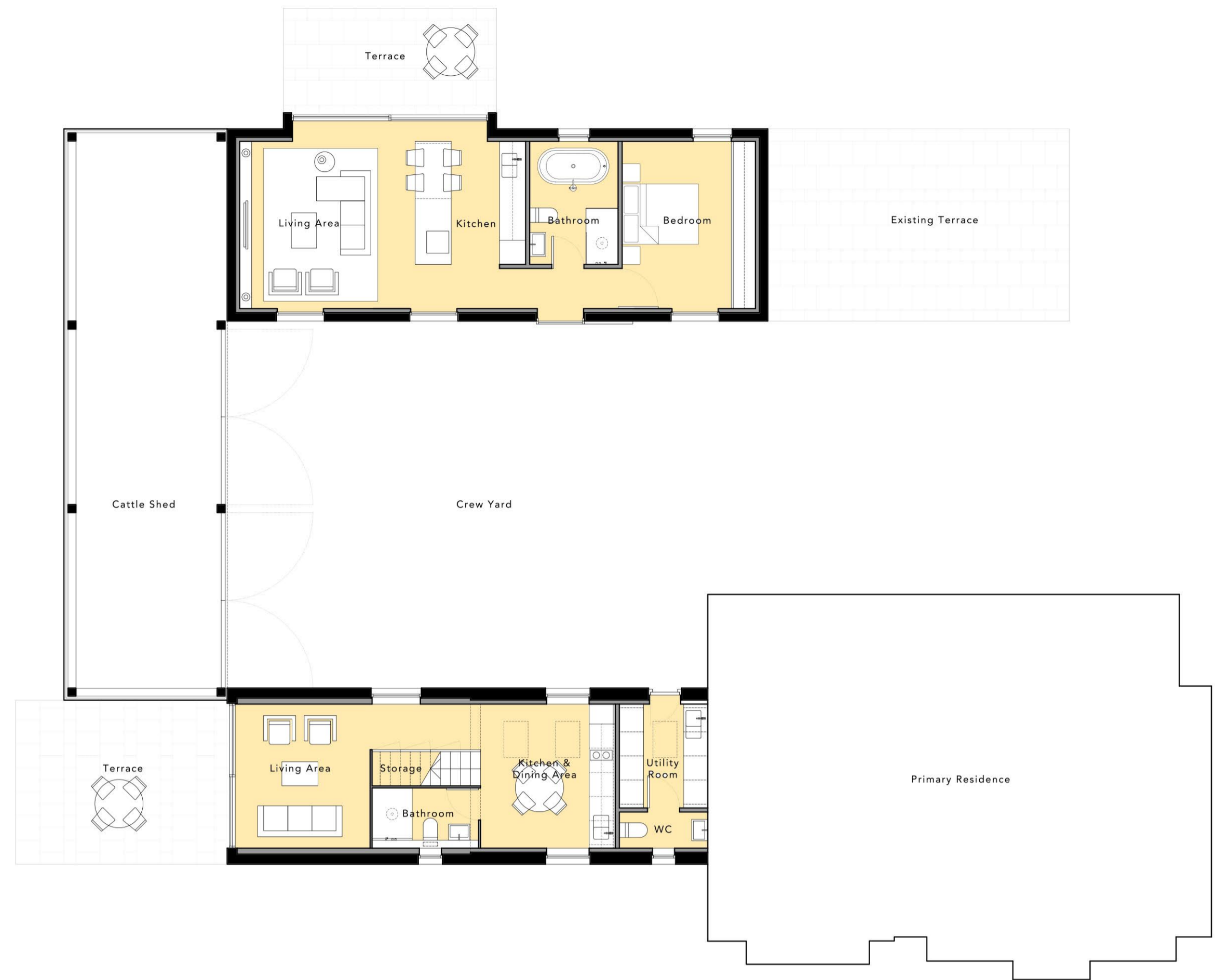
Level 0 Plan - Proposed 1:100 @ A1