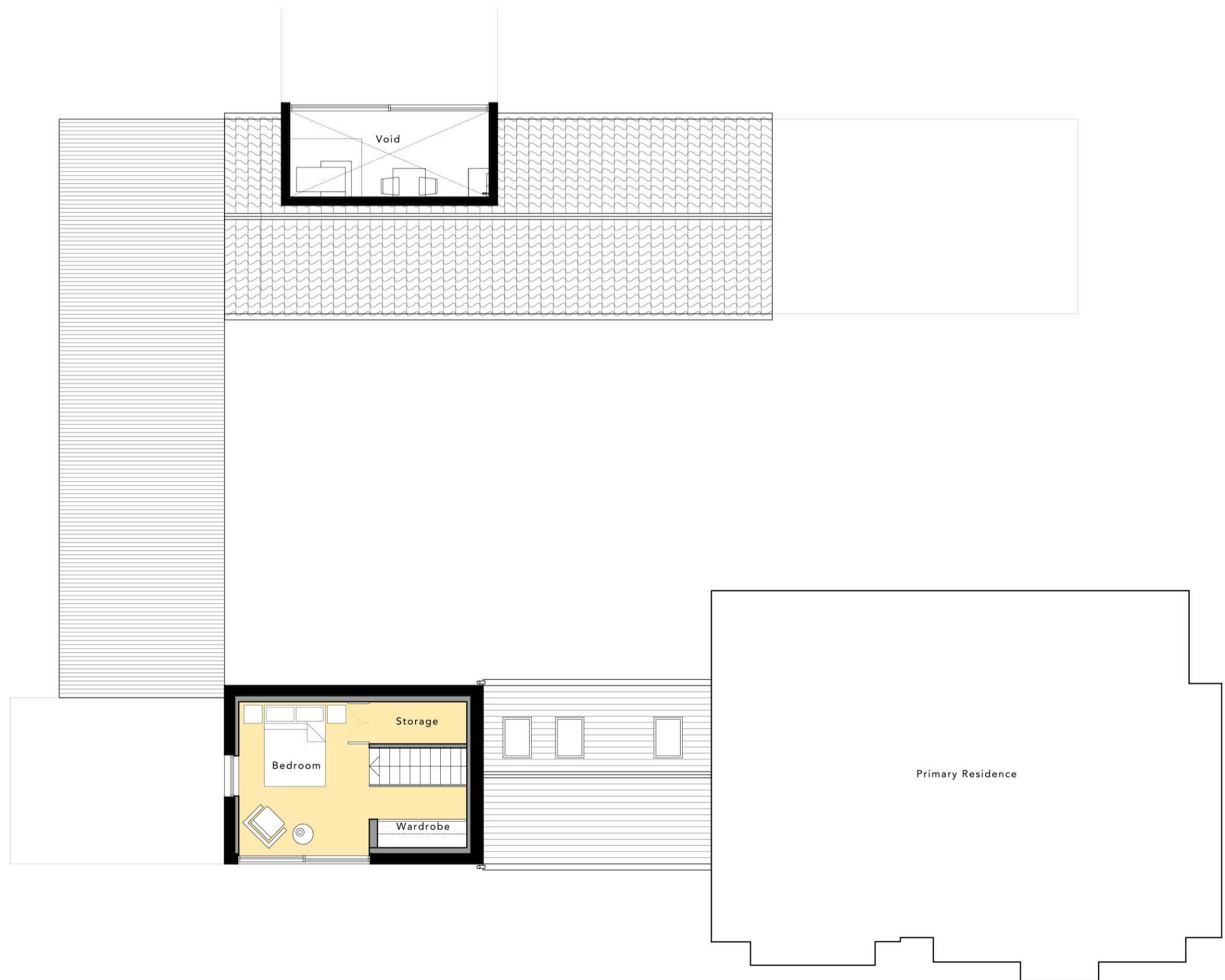
Level 1 Plan - Proposed 1:100 @ A1