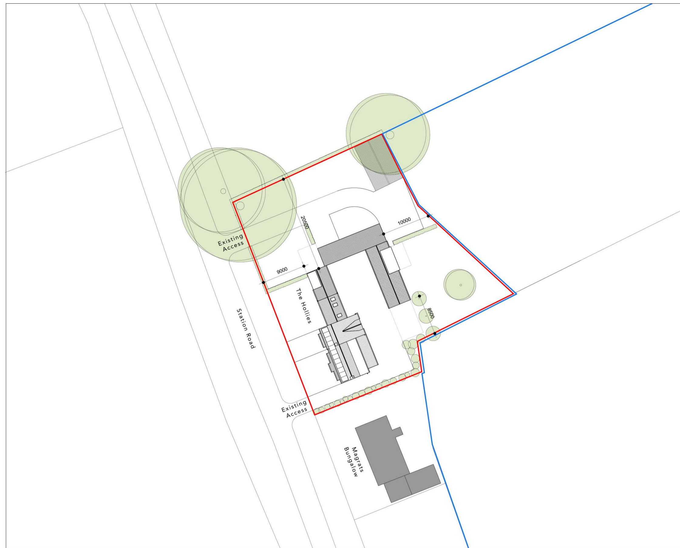
Site Plan - Proposed 1:500 @ A1