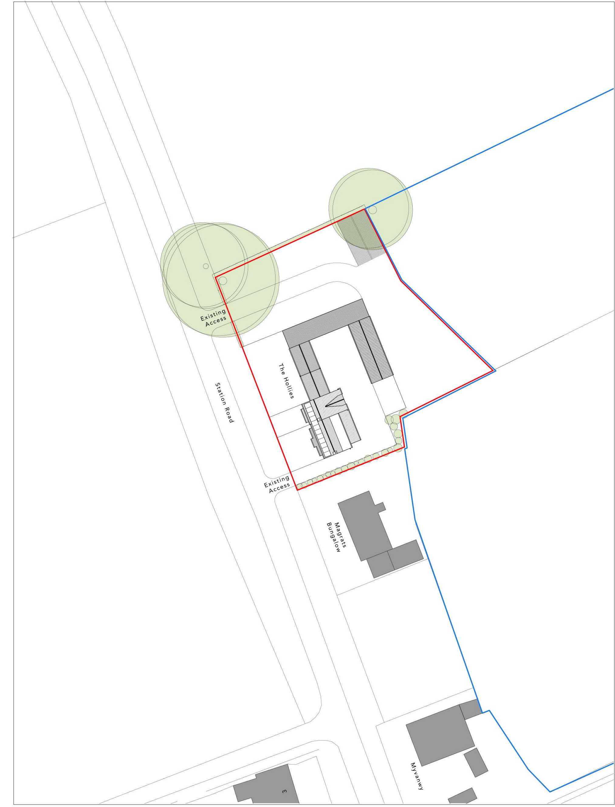
Site Plan - Existing 1:500 @ A1

Proposal Address The Hollies Station Road Donington on Bain Louth Lincolnshire LN11 9TR