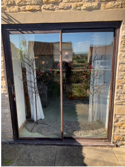
The back patio doors