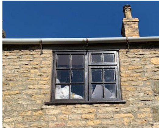
The back top right bedroom and bathroom windows