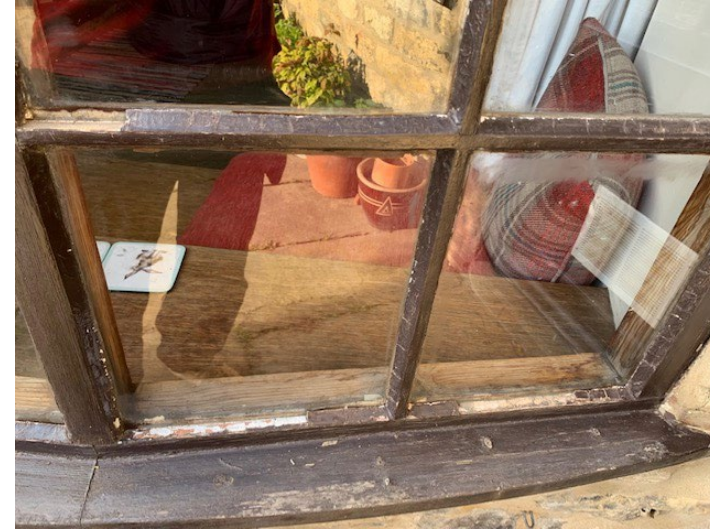
The back lounge window damage to putty and wood