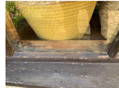
Paintwork on all windows in a bad state