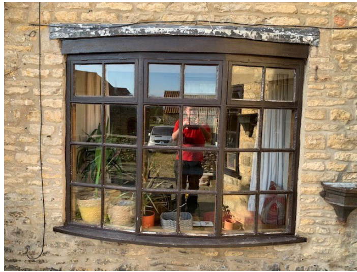
The back lounge window