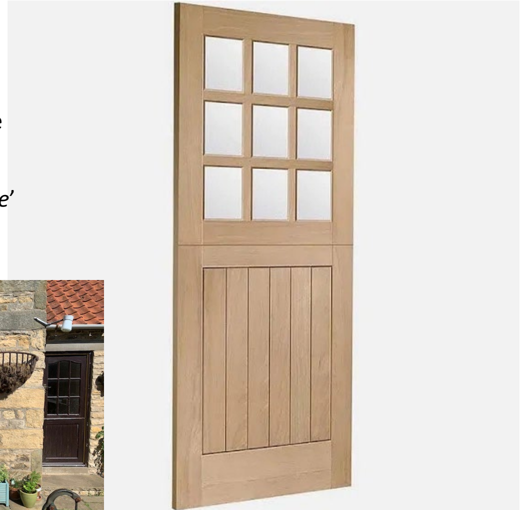
Picture showing both back kitchen doors

This is the 2 nd kitchen door (that we do not use) and we propose replacing it with the new door to the right, and we will paint it ' Prairie Sage ' R263C