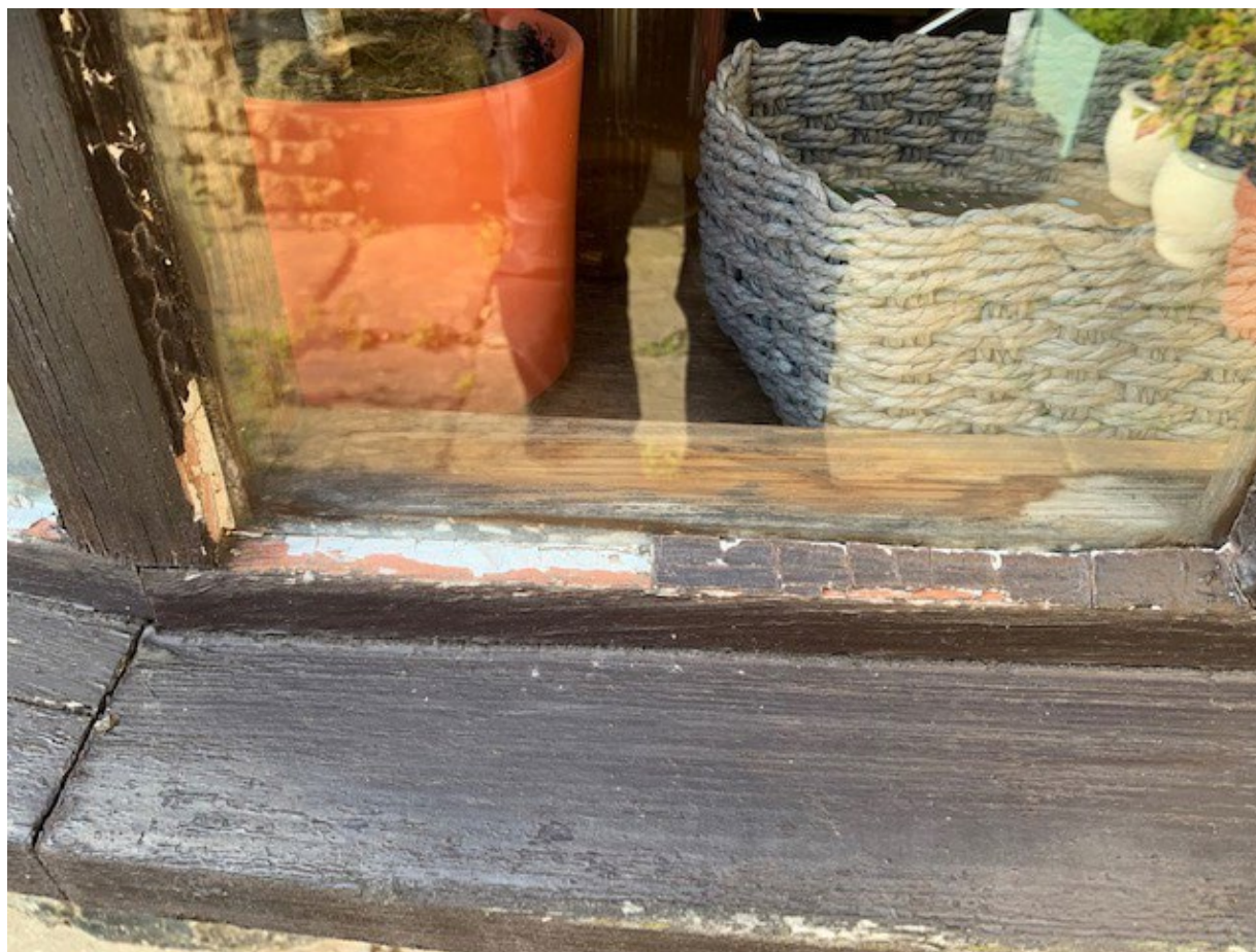
This picture shows the general state of the windows around the back of the property – badly weathered & damaged woodwork and putty loose and missing