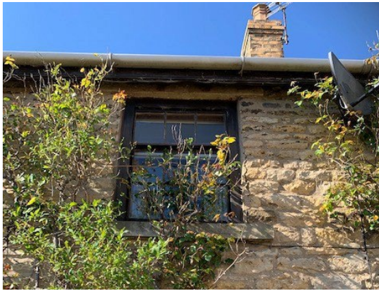
The back top middle window