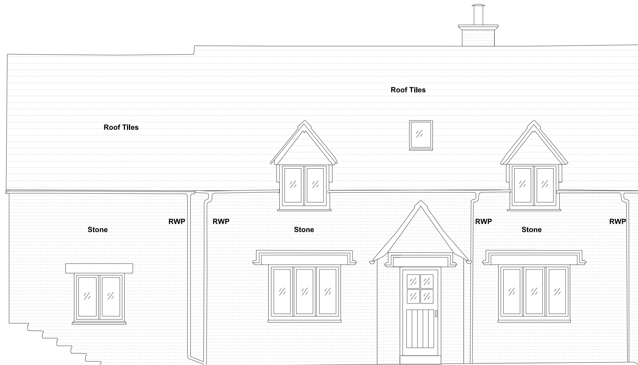
- EXISTING ELEVATION 01 - 1:50 SCALE @ A1

The drawing and the works depicted are the copyright of this practice and may not be reproduced except by written permission.