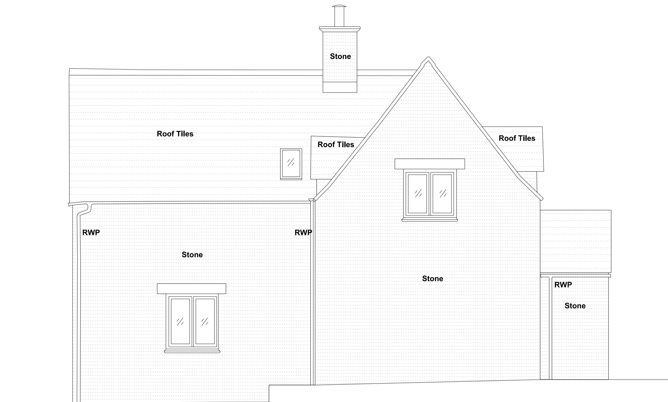
- EXISTING ELEVATION 04 - 1:50 SCALE @ A1