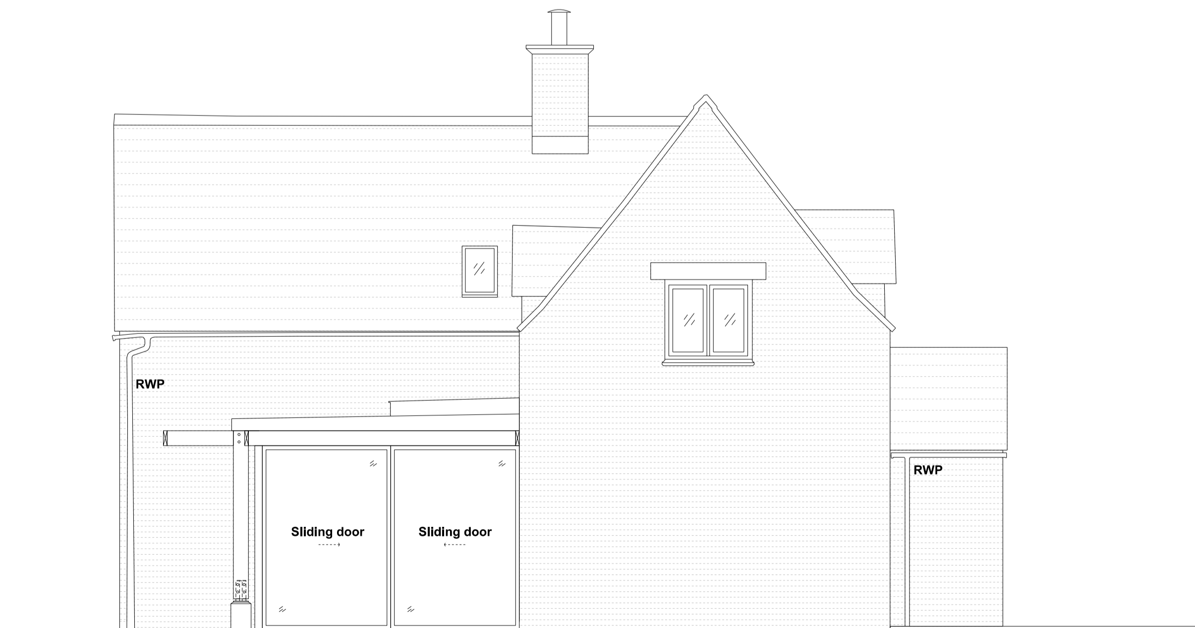
- PROPOSED ELEVATION 04 - 1:50 SCALE @ A1