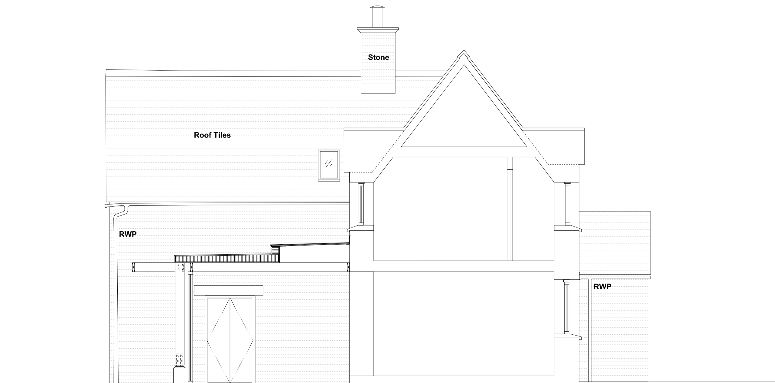
- PROPOSED SECTION DD - 1:50 SCALE @ A1