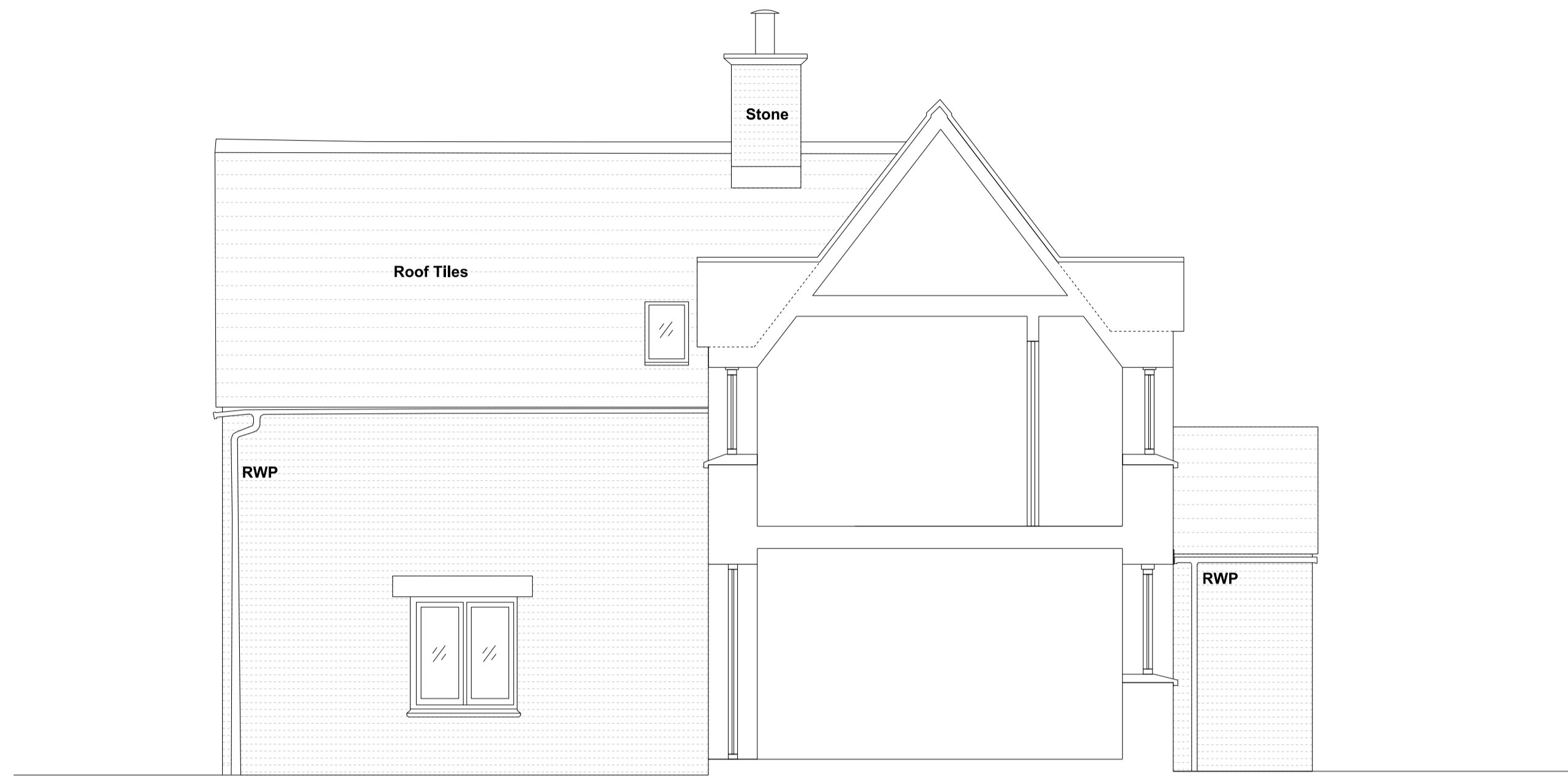
- EXISTING SECTION DD - 1:50 SCALE @ A1