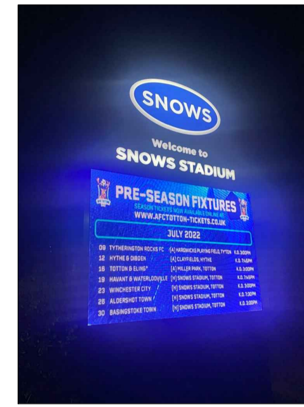
Signage Layout (in situ)