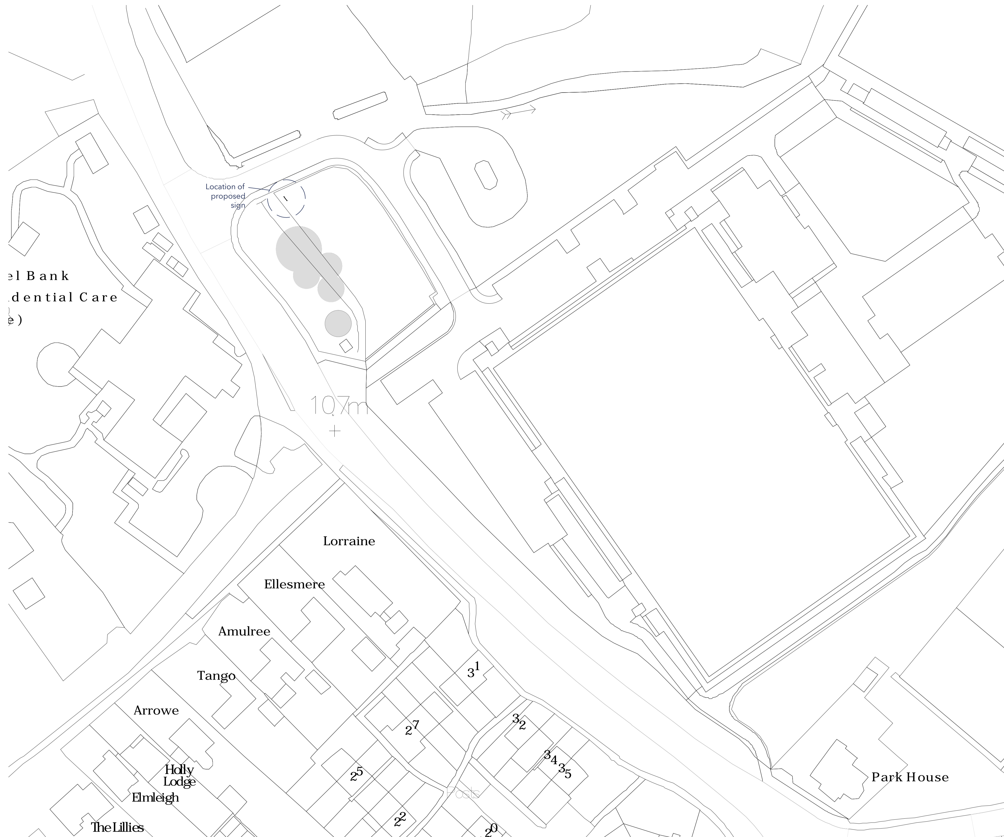
Site Plan AS PROPOSED Scale 1:500

Key: ● Indicative existing tree location