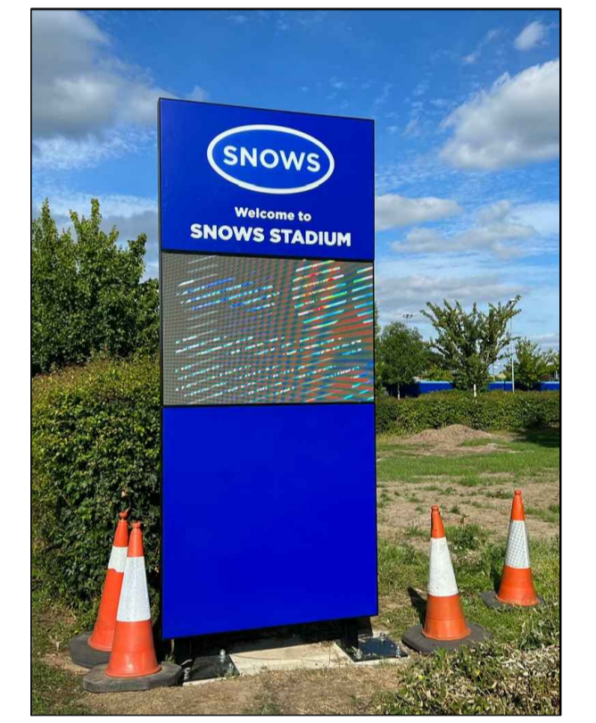
Signage (in situ)