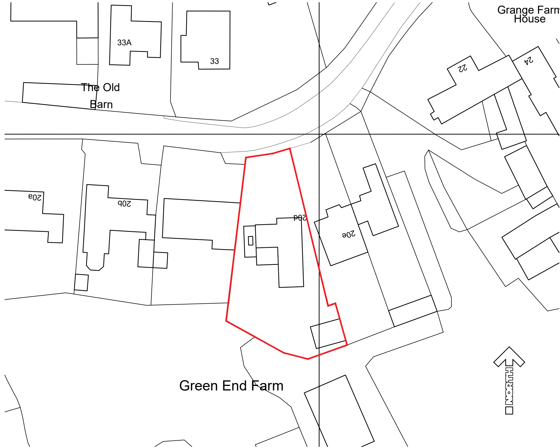
PROPOSED BLOCK PLAN I-500