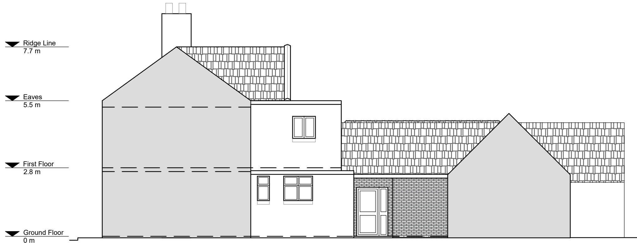
Existing Side (North East) Elevation