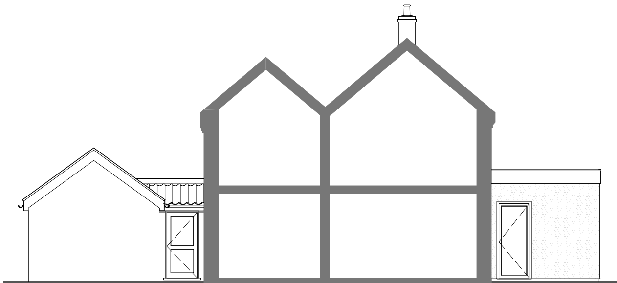
SIDE SECTIONAL ELEVATION As Proposed AT 1:100