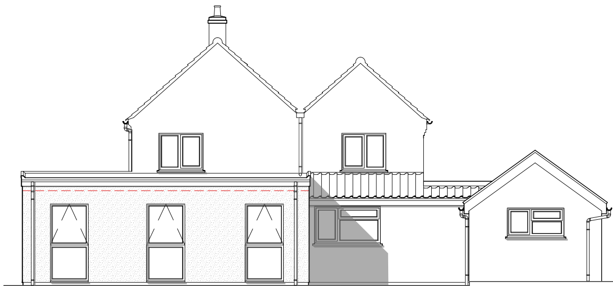
SIDE ELEVATION As Proposed AT 1:100