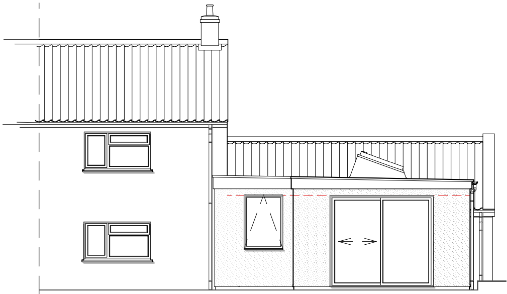
REAR ELEVATION As Proposed AT 1:100