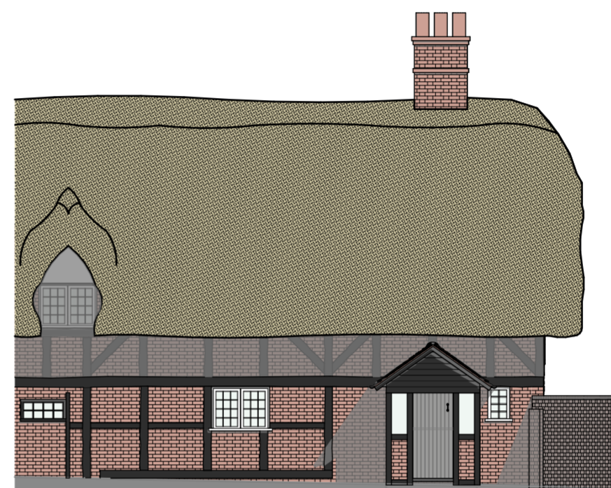
EXISTING SIDE (Northeast) 1:100