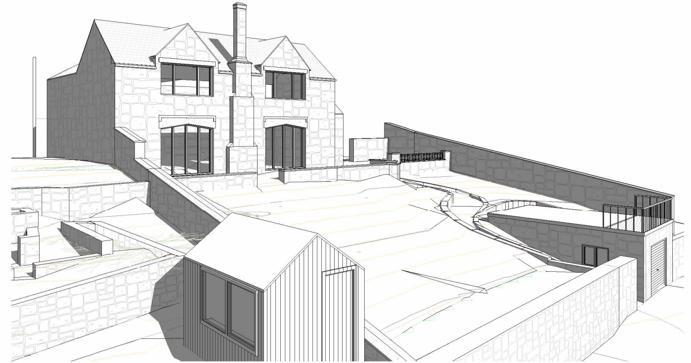
2 3D View 2