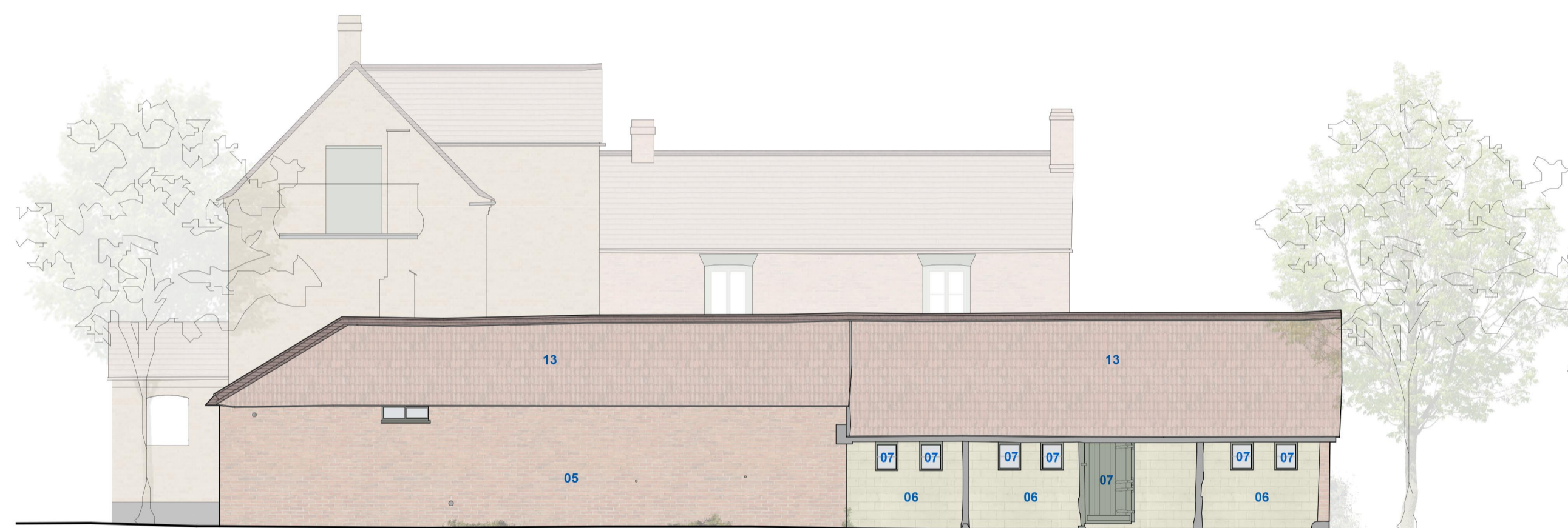
03 NORTH BARN - EXISTING WEST ELEVATION 1:100