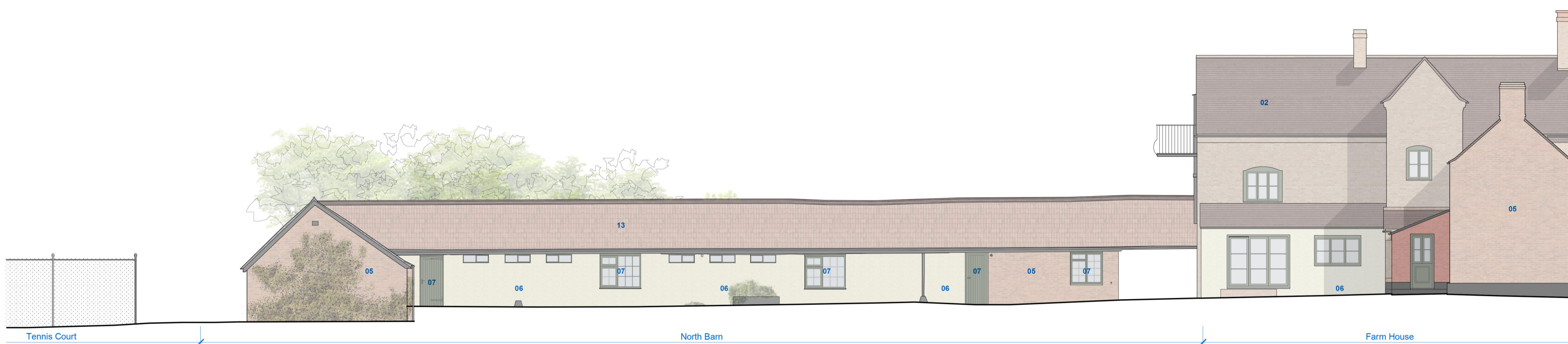
01 NORTH BARN - EXISTING SOUTH ELEVATION 1:100