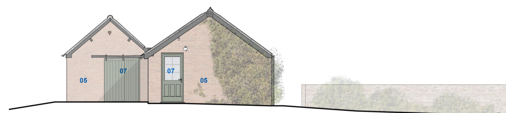
03 EAST BARN - EXISTING NORTH ELEVATION 1:100