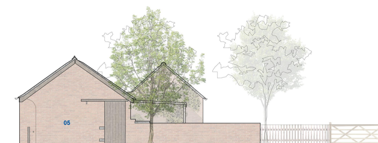
05 EAST BARN - EXISTING SOUTH ELEVATION 1:100

DRAWING REPRODUCED FROM ORIGINAL SURVEY DRAWINGS PREPARED BY THIRD PARTY. CONTACT DETAILS ON REQUEST.