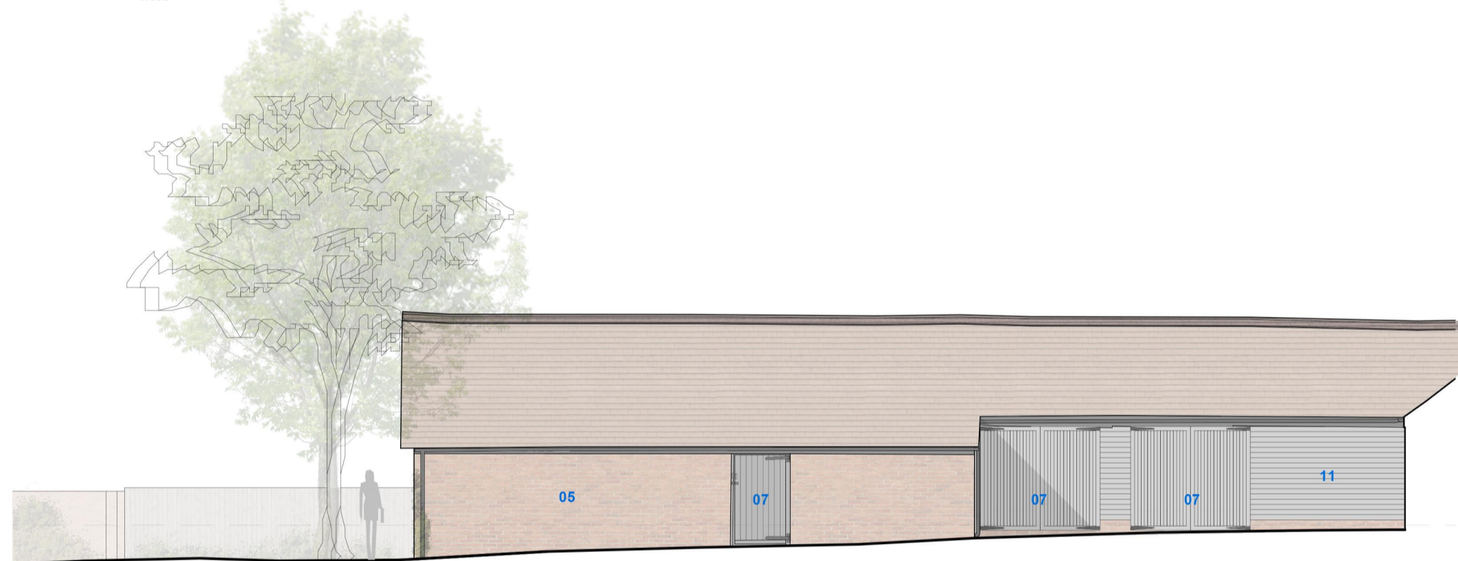
02 NORTH BARN - PROPOSED EAST ELEVATION 1:100