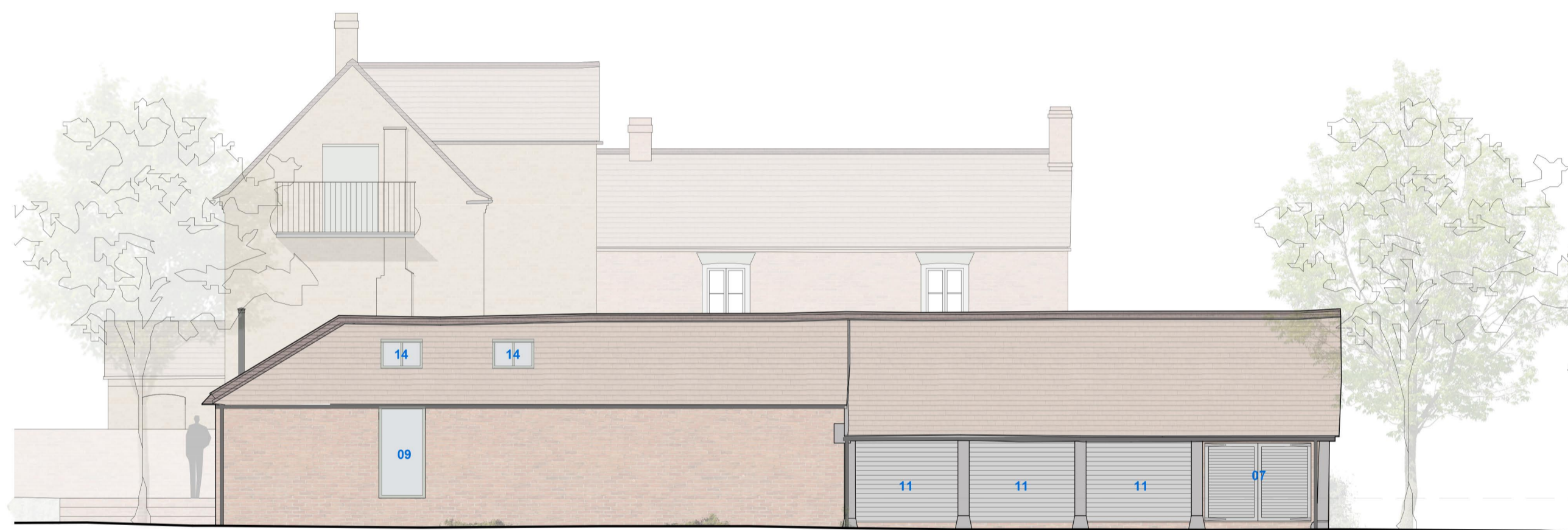
03 NORTH BARN - PROPOSED WEST ELEVATION 1:100