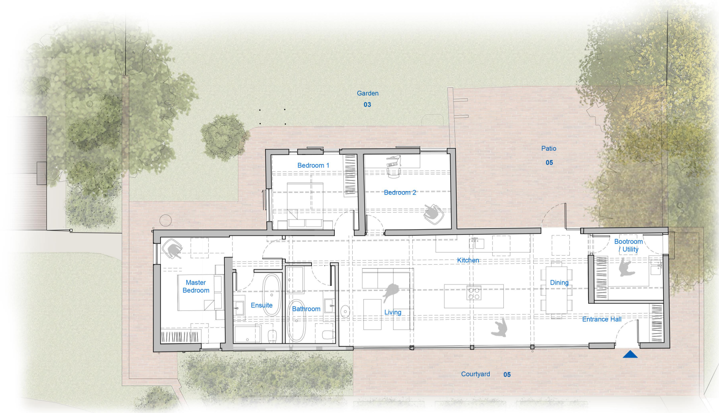
01 EAST BARN - PROPOSED GROUND FLOOR PLAN 1:100