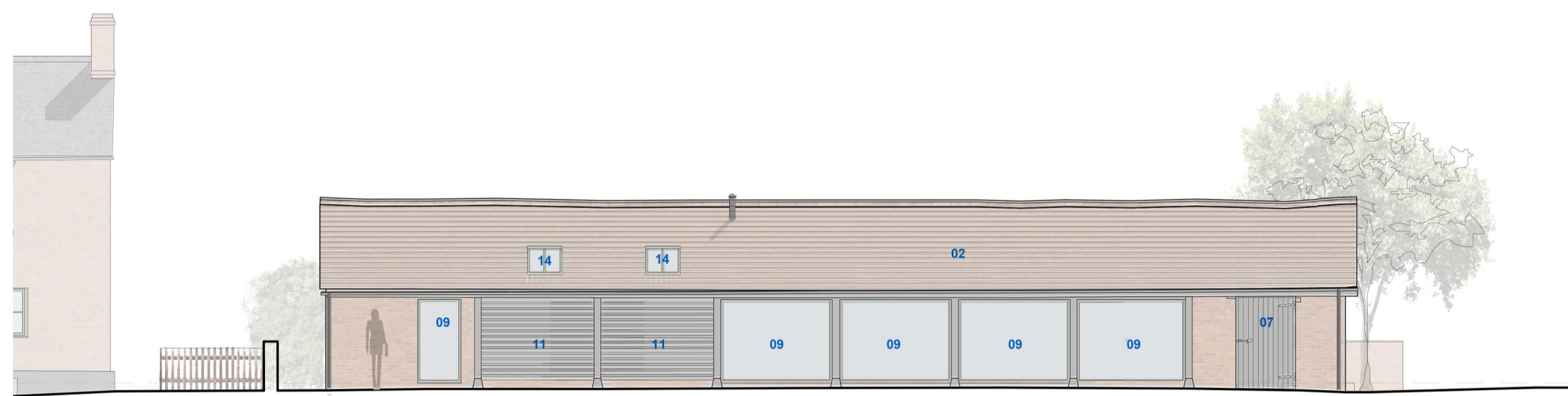
02 EAST BARN - PROPOSED WEST ELEVATION 1:100