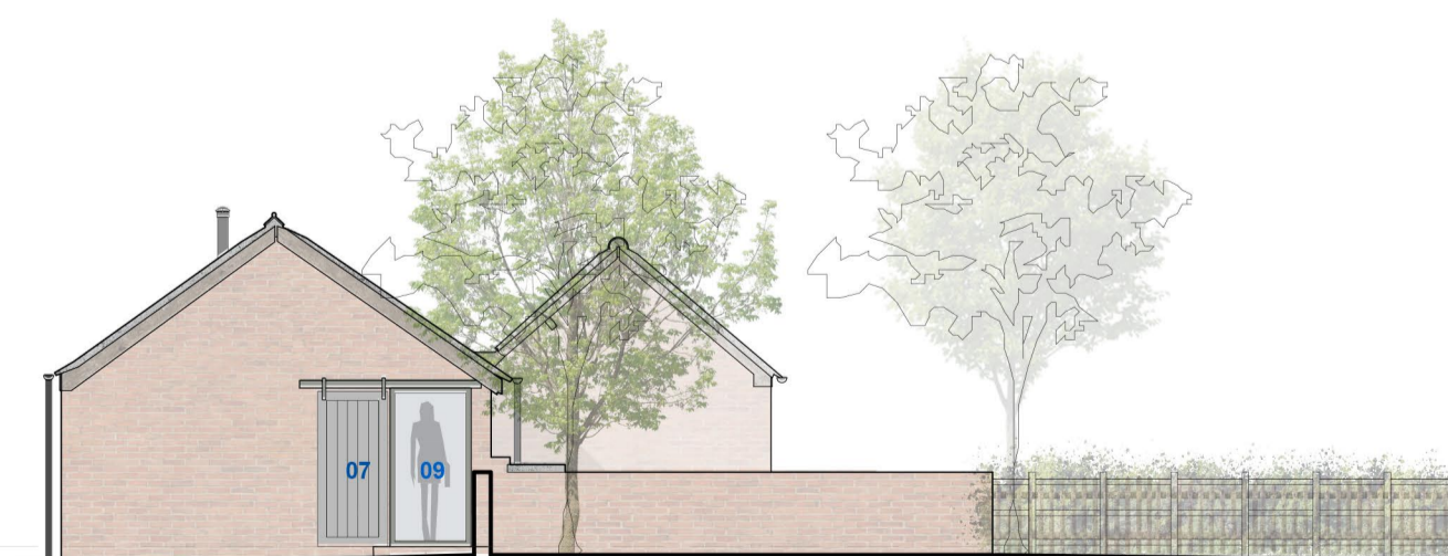
05 EAST BARN - PROPOSED SOUTH ELEVATION 1:100

DRAWING REPRODUCED FROM ORIGINAL SURVEY DRAWINGS PREPARED BY THIRD PARTY. CONTACT DETAILS ON REQUEST.