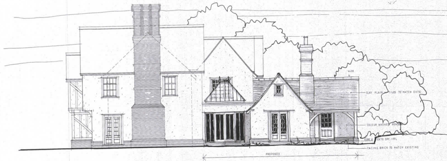
SIDE (AS PROPOSED) 1/50 (A1)