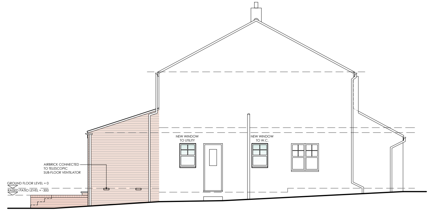
PROPOSED SIDE ELEVATION (1)