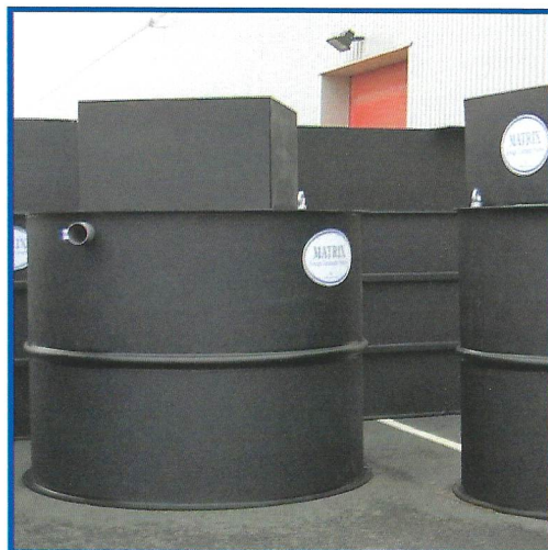
CLF1 - 6pe Treatment Plant ready for delivery.