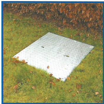
CLF1 - 6pe Fully Installed.

The MATRIX treatment system is a three stage biological process contained within a single tank structure, based on the principles of a submerged bed reactor and designed in accordance with the requirements of BS6297. Careful configuration of the internal flowpath and the inclusion of non-mechanical recirculation systems ensures optimal process performance as demonstrated by the exceptional results obtained from the independent testing, providing complete peace of mind for the end user. There are NO electrical or mechanical components within the treatment plant thereby eliminating the need for any specialist servicing arrangements ensuring that any maintenance requirements on the MATRIX system are kept to an absolute minimum.