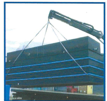
CLF9 - 70pe Treatment Plant being Loaded.