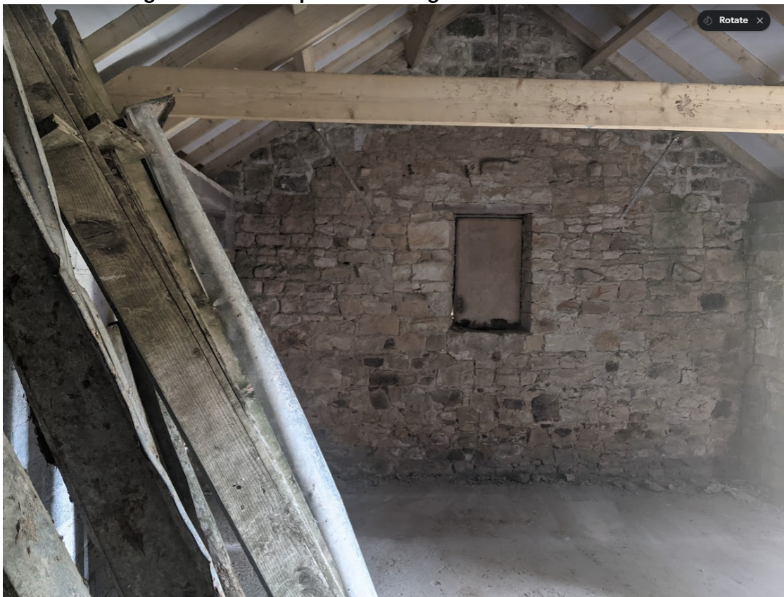
Figure 3 - Internal photo showing gable wall/ roof