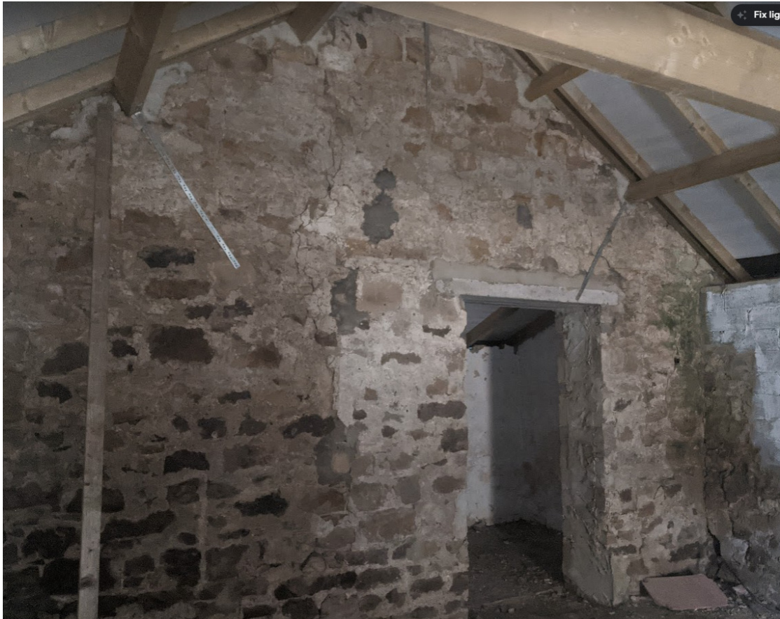
Figure 2 - Internal photo showing wall and roof structure