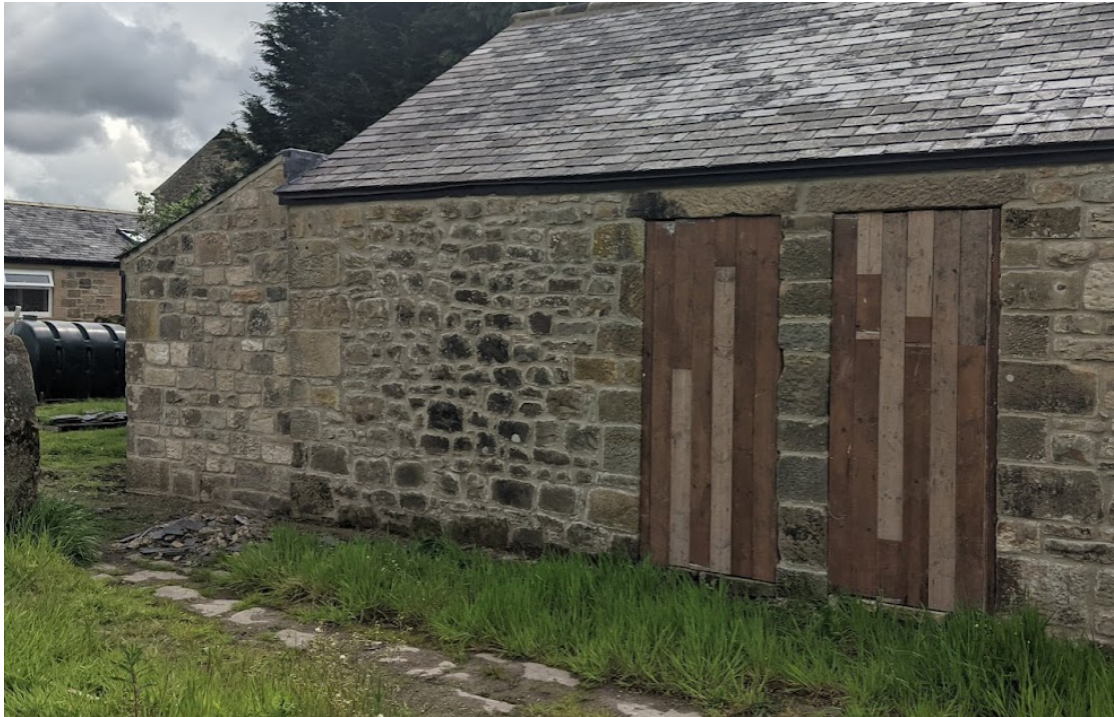
Figure 4 - External photo showing lean too to East