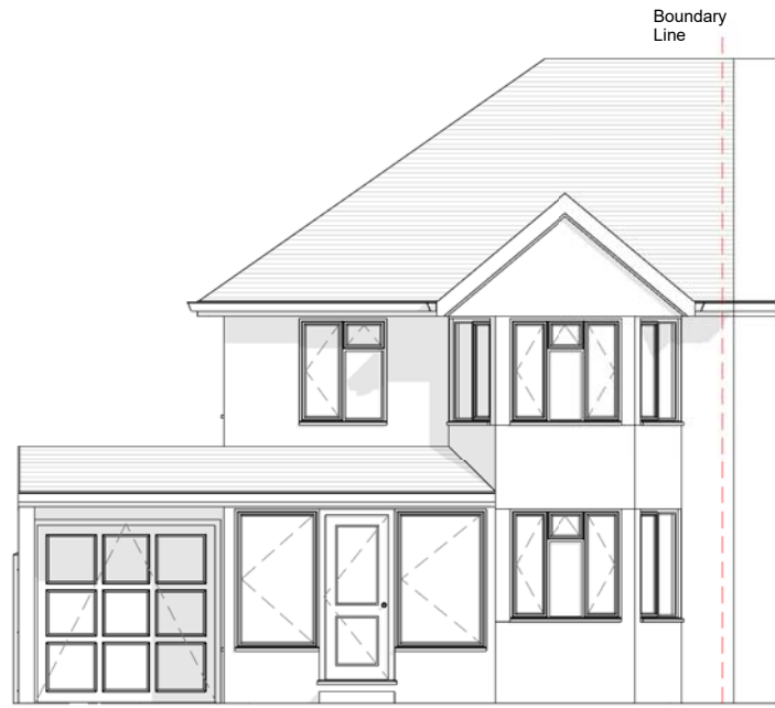
1 Front 1 : 100

NOTE: THIS DRAWING HAS BEEN PRODUCED BY ELECTRONIC MEANS. SHOULD THE SCALE MEASUREMENTS BE TAKEN BY MEANS OTHER THAN ELECTRONIC (e.g. FROM A PRINTED COPY), THE FOLLOWING MUST BE TAKEN INTO CONSIDERATION BEFORE SCALING IS UNDERTAKEN: ENSURE THAT THE COPY HAS BEEN PRINTED/PLOTTED ON THE STATED SHEET SIZE WITH THE PLOTTING/PRINTING SCALE SET TO A CORRECT RATIO.