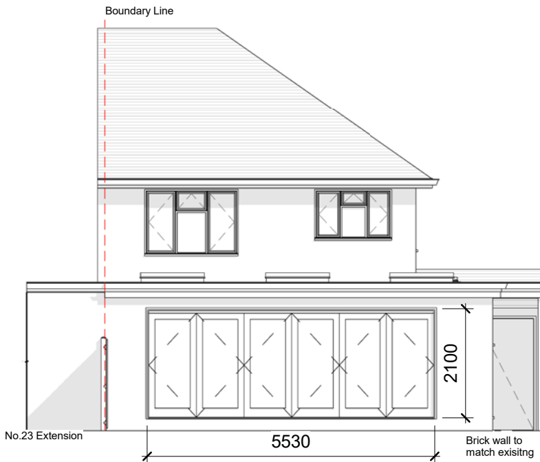
3 Back 1 : 100