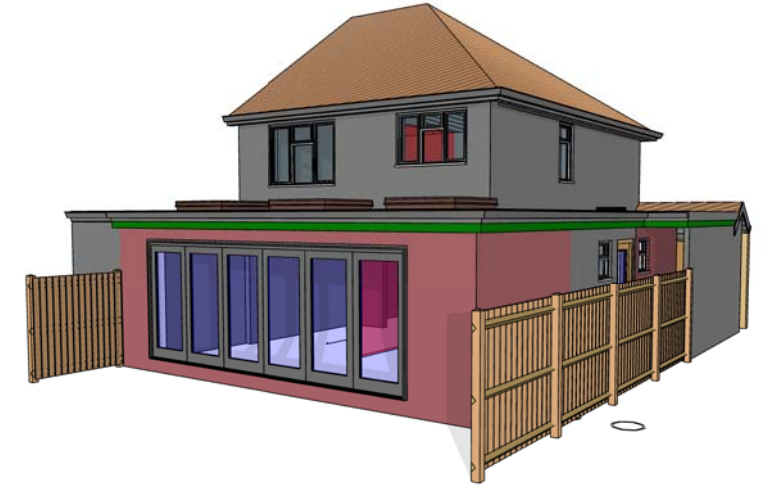
5 3D Rear Visual