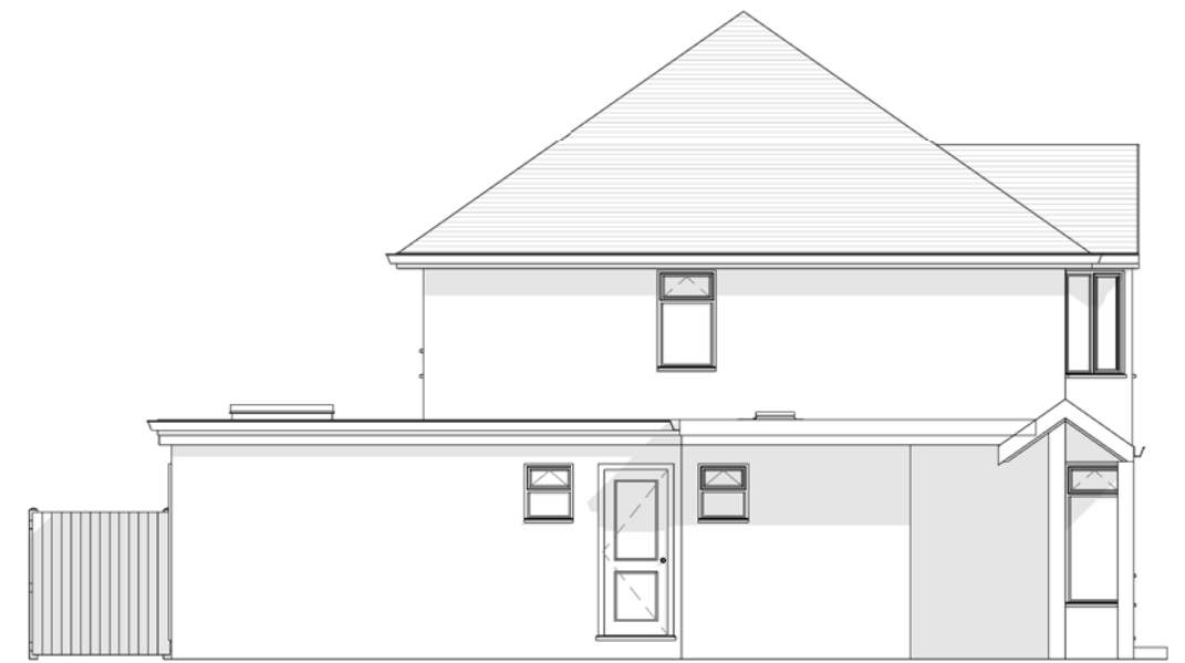
6 L/H Side Section 1 : 100