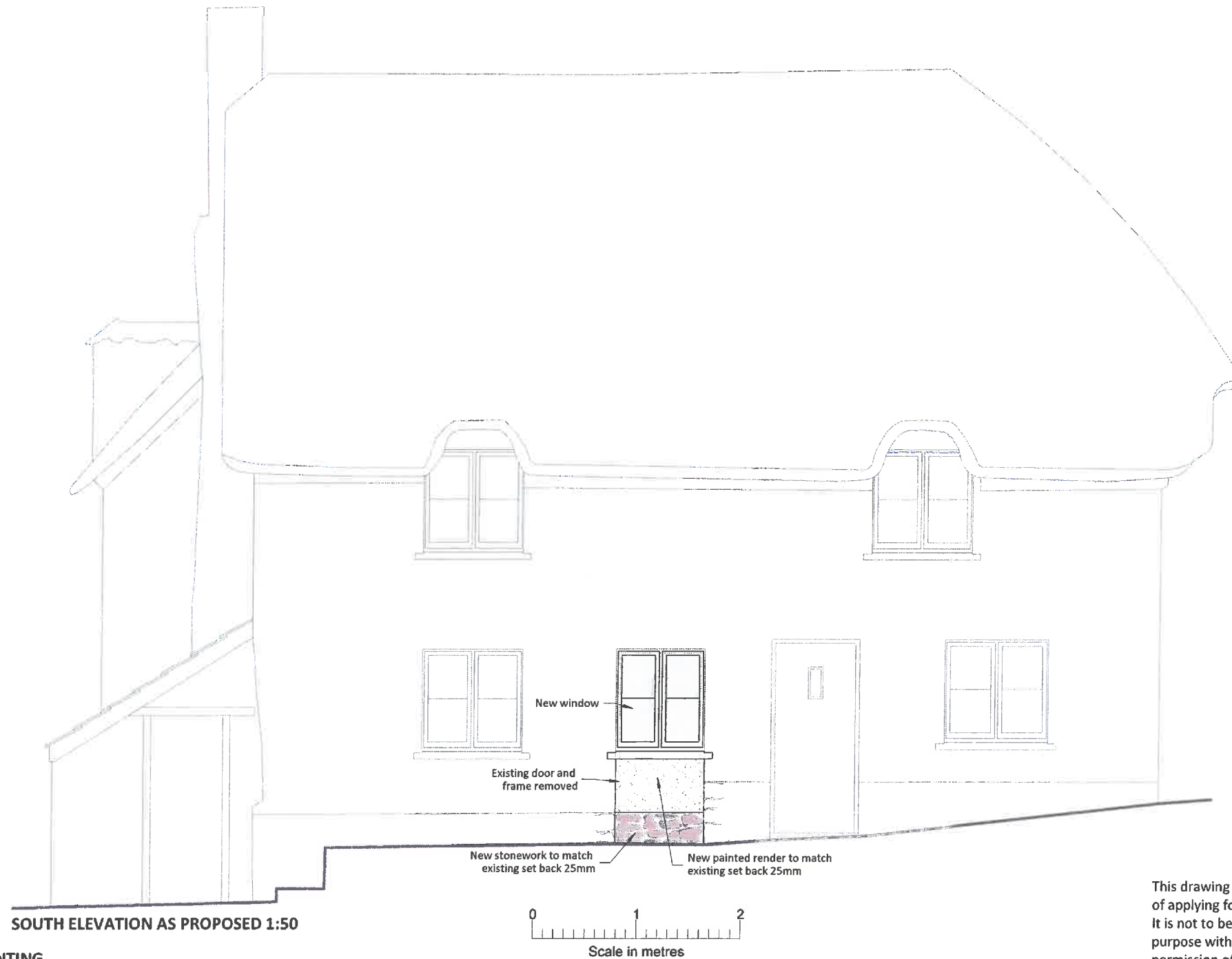
SOUTH ELEVATION AS PROPOSED 1:50

This drawing is solely for the purpose of applying for Listed Building consent. It is not to be used for any other purpose without the express permission of the designer. © Miles Snowdon Design 2022