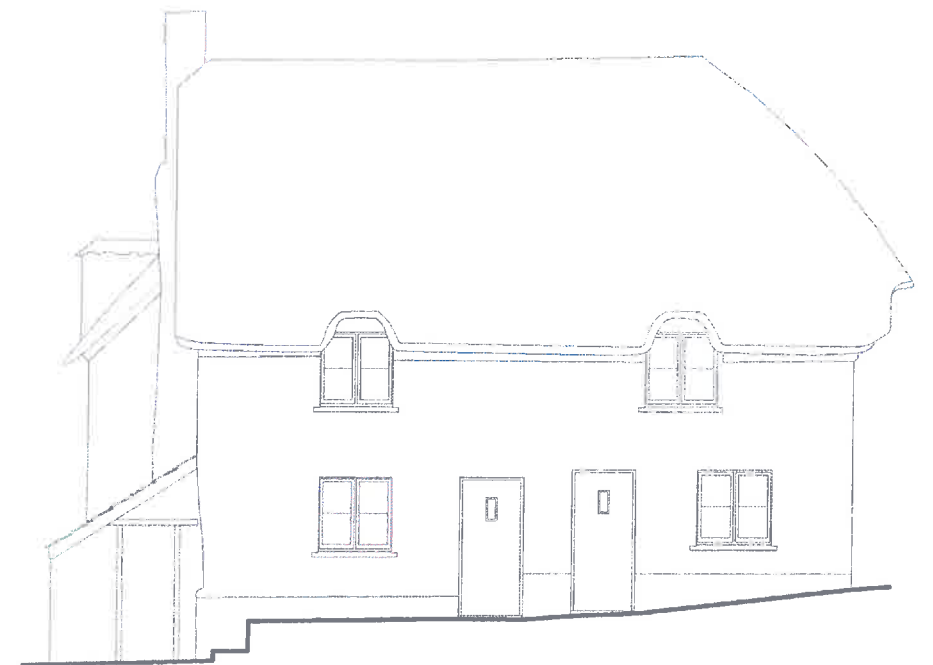
SOUTH ELEVATION AS EXISTING 1:100