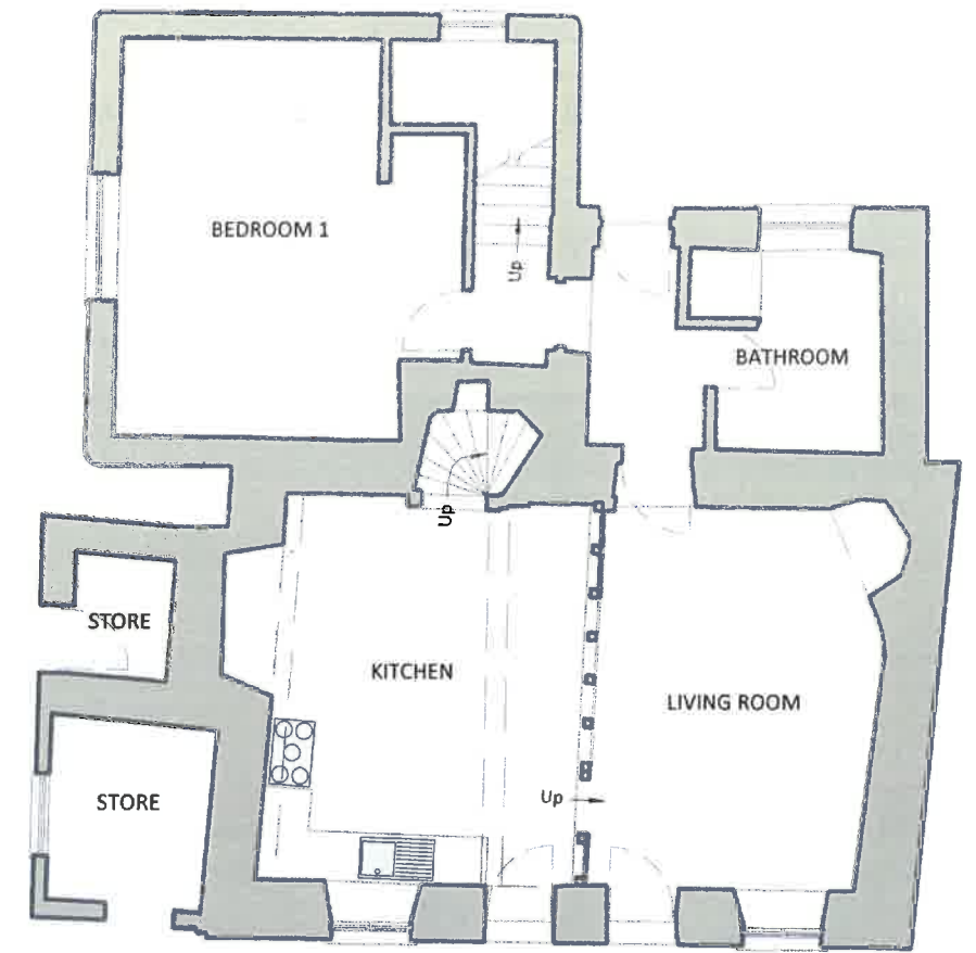
GROUND FLOOR PLAN AS EXISTING 1:100