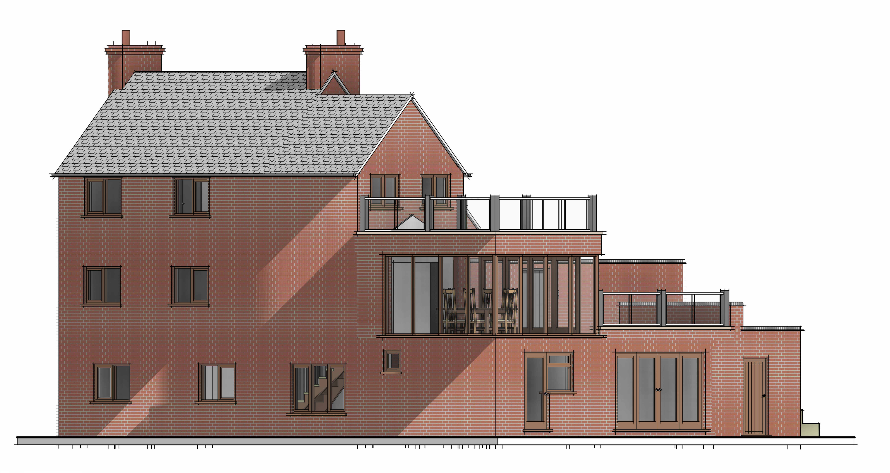
4 3D REAR