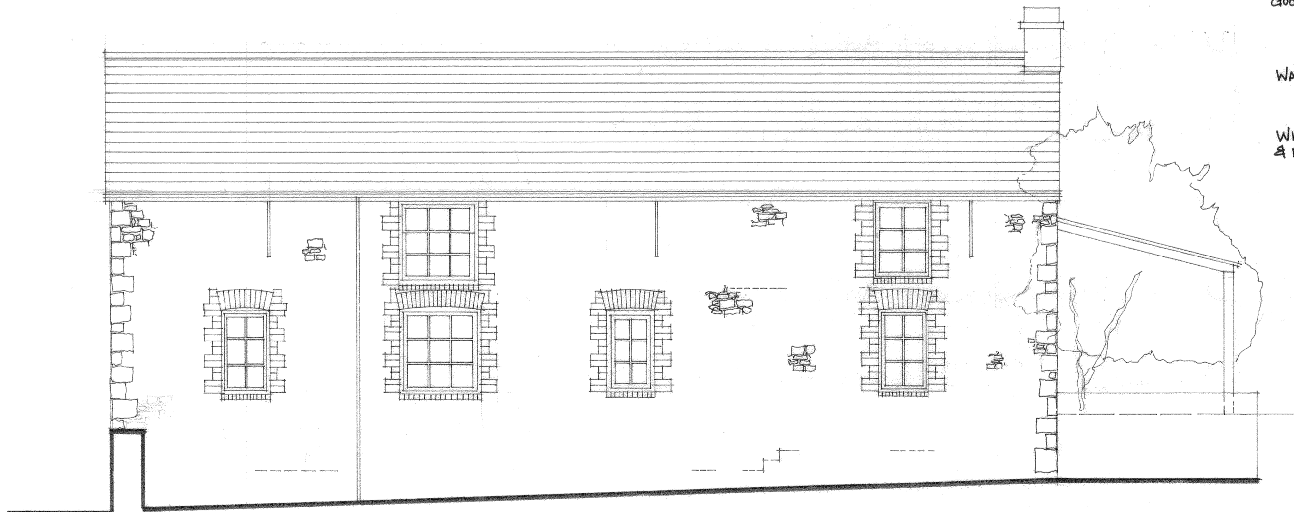
WEST ELEVATION AS EXISTING.

WINDOWS & DOORS : Painted softwood joinery. Single & double glazed units