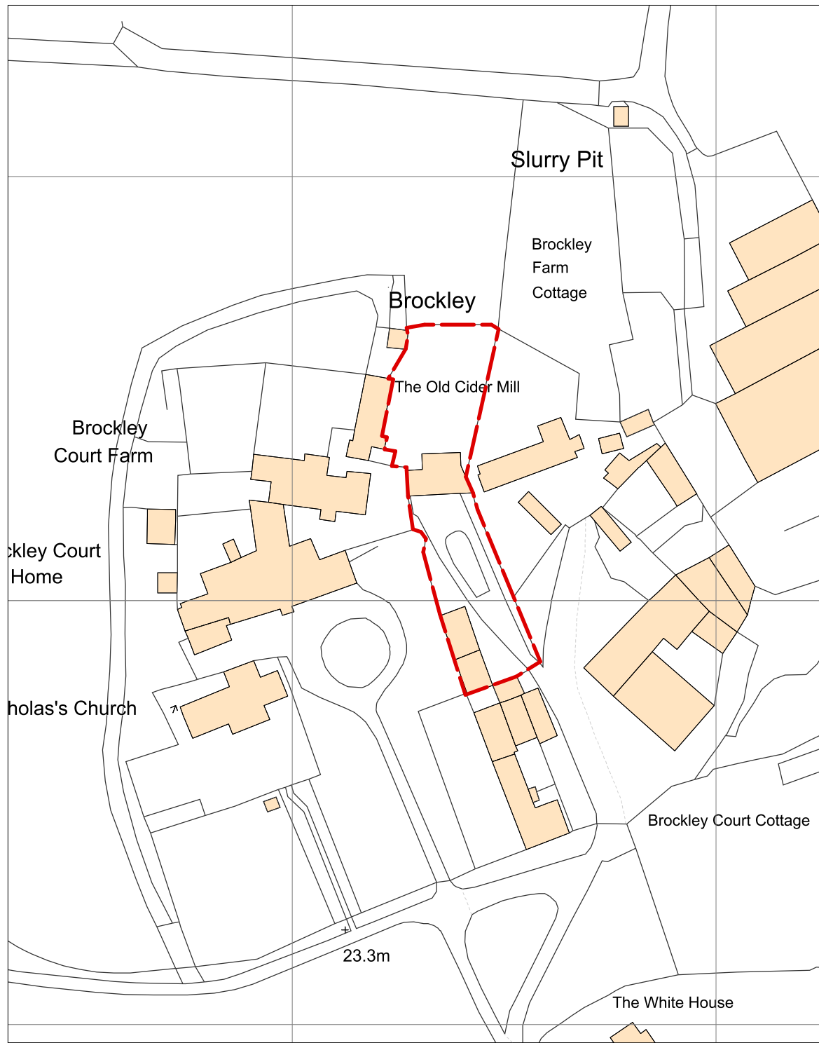
Location Plan at 1:1250