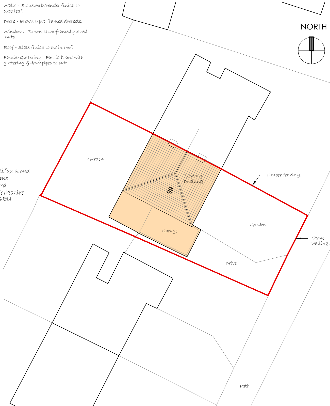
EXISTING BLOCK/ROOF PLAN SCALE - 1:200

99, Halifax Road Denholme Bradford West Yorkshire BD13 4EU