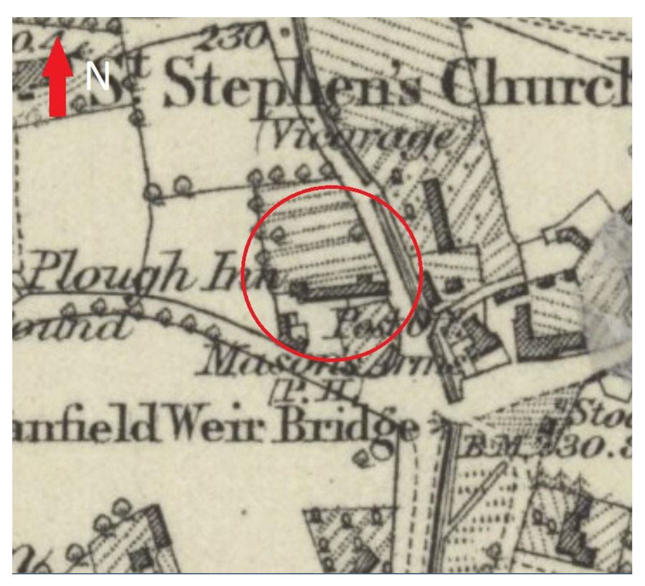
Figure 2. The Ordnance Survey map of 1884 with the Site location indicated in red shows that the two individual structures shown on the earlier tithe map had been connected through an in-fill extension, presumably the single storey with attic range that is present to this day.

The property appears to have remained a private dwelling until at least the late-19<sup>th</sup> century; the Ordnance Survey map of 1884 shows the Site labelled as the Plough Inn (see Figure 2 ). The map also shows the two separate buildings on the earlier tithe map now conjoined with an infill extension and a projecting bay extension to the north.