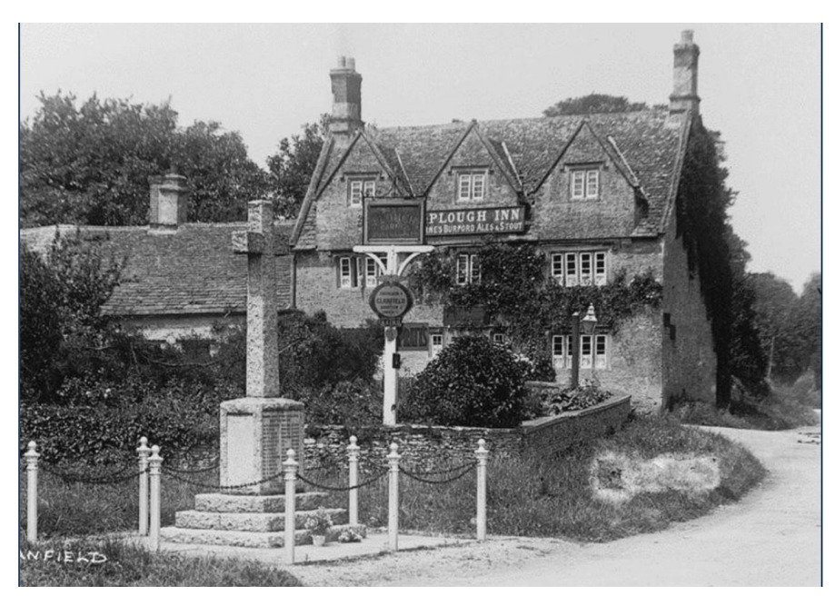
Figure 4. A photograph of the Site taken c. 1920s showing the mid- 17^{th} century three bay range with the 19^{th} century single storey infill extension projecting to the left. The Site changed use from private residential use to public house sometime in the 19^{th} Century.

The Site has subsequently obtained full planning and listed building consents for internal and external alterations, culminating in the two-storey erection projecting to the north of the 19<sup>th</sup> century extensions to provide further hotel accommodation. A further full planning and listed building consent application for a single storey kitchen extension was granted in November 1996, but was not implemented. And most recent planning approval for rear extension housing extension to restaurant.