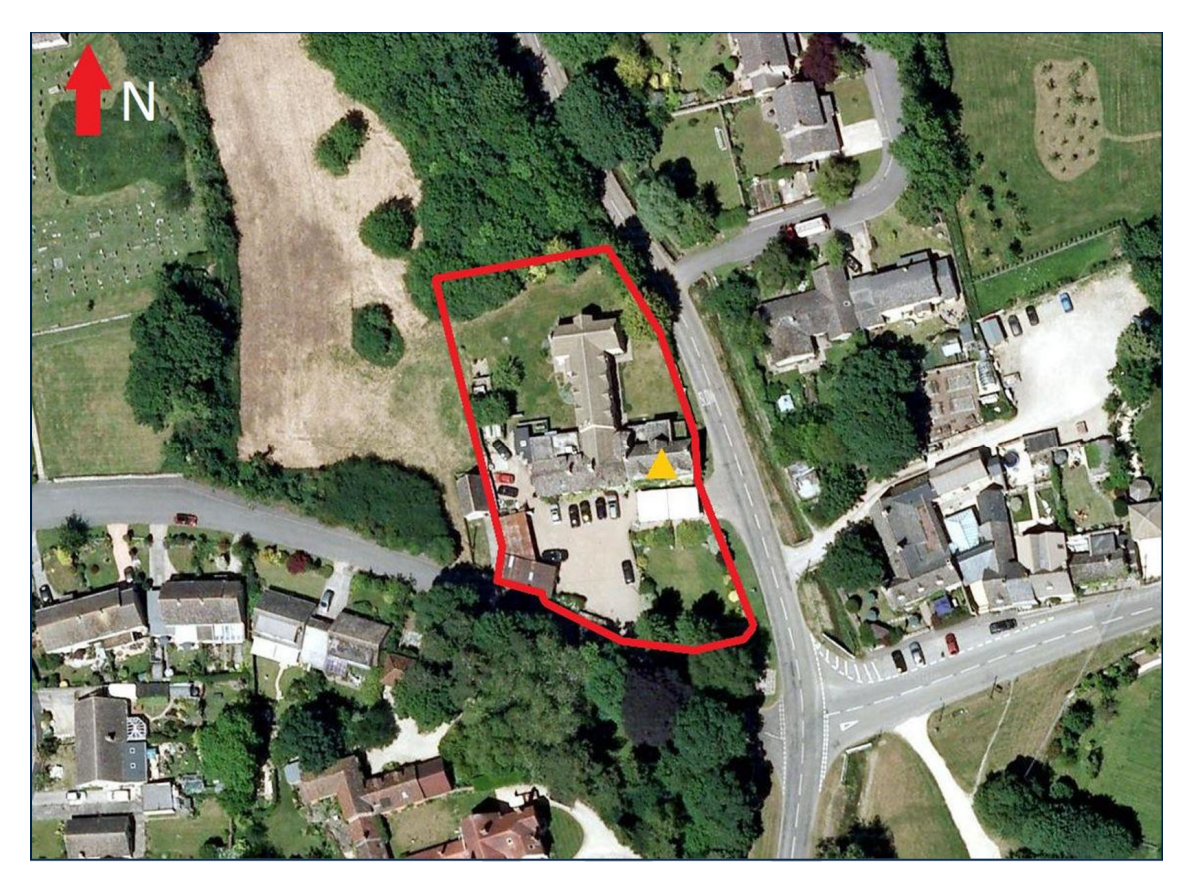
Figure 5: Aerial image of the indicative Site location (outlined in red). The designated heritage assets are denoted in yellow

The Plough is sited on Bourton Rd, Clanfield, Bampton OX18 2RB, with 51°42′59.8″N 1°35′20.6″W coordinates. The building is in plain sight with main entrance accessed via Pound Lane, historic access was via Bourton Road. The Site is located to the west side of Bourton Road, which delineates its eastern boundary, and is bounded by Pound Lane to the south. An area of land densely planted with trees bounds the Site to the north and west. The immediate setting is characterised by a traditional English village vernacular with a wider setting of agricultural farmland. The Site is located within the village and civil parish of Clanfield, situated in the local authority of West Oxfordshire District Council. The Site consists of a detached three-bay, two-storey building with attic dating from the mid- to late-17<sup>th</sup> century and constructed in uncoursed limestone rubble with stone slate roof.