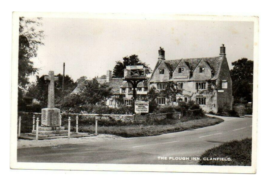
Figure 3. A postcard from the 1960s showing the Site with minor alterations to the plan form, including the construction of dormer windows to the 19^{th} century western in fill extension