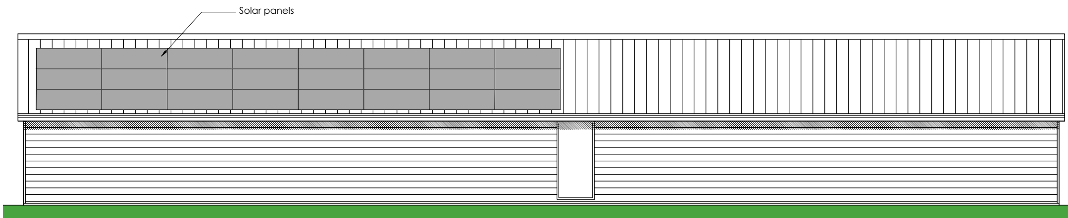
PROPOSED SIDE ELEVATION - EAST