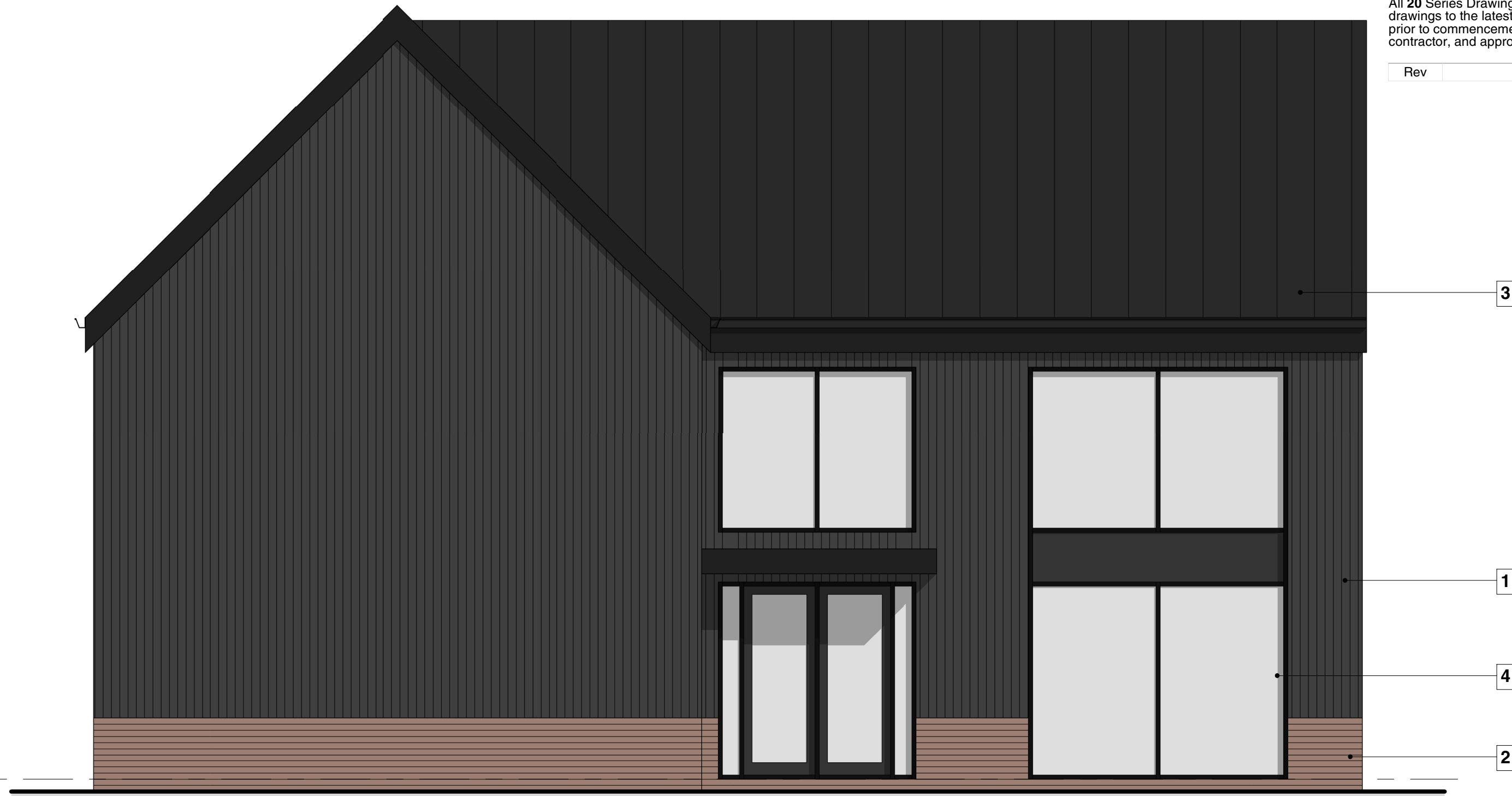
B - UNIT 01 SIDE ELEVATION 01 1 : 50