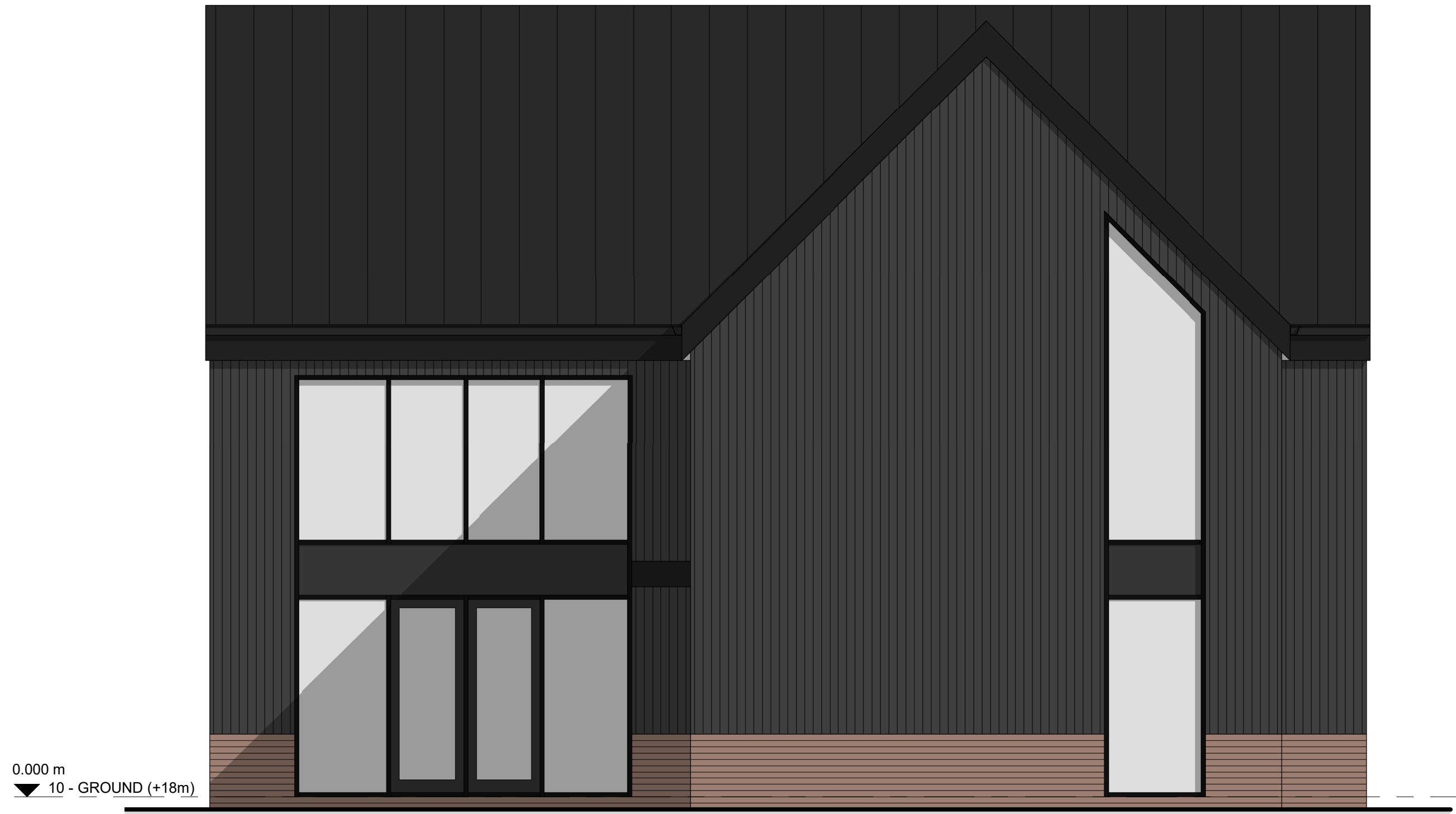
A - UNIT 01 FRONT ELEVATION 1 : 50