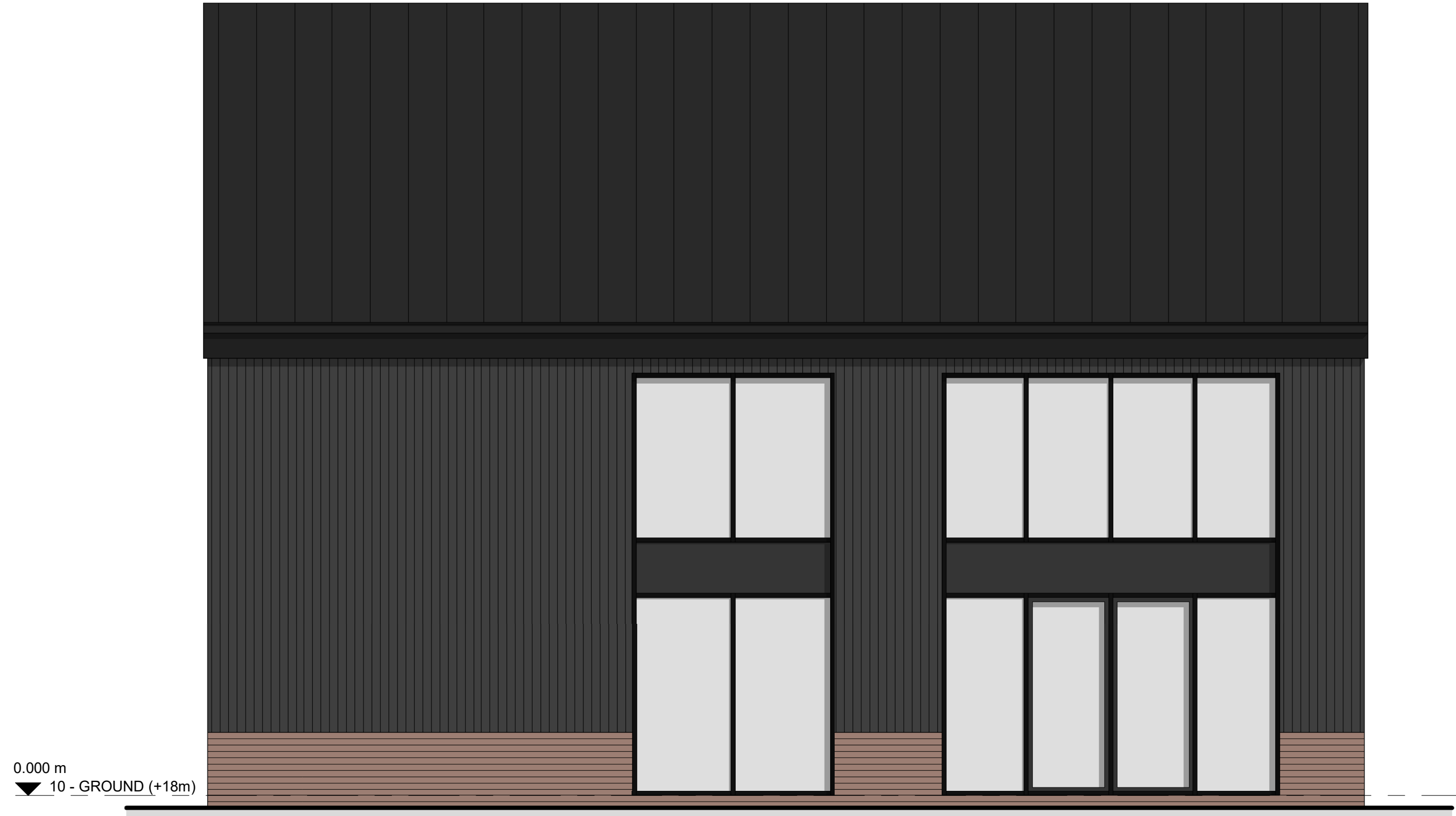
C - UNIT 01 REAR ELEVATION 1 : 50