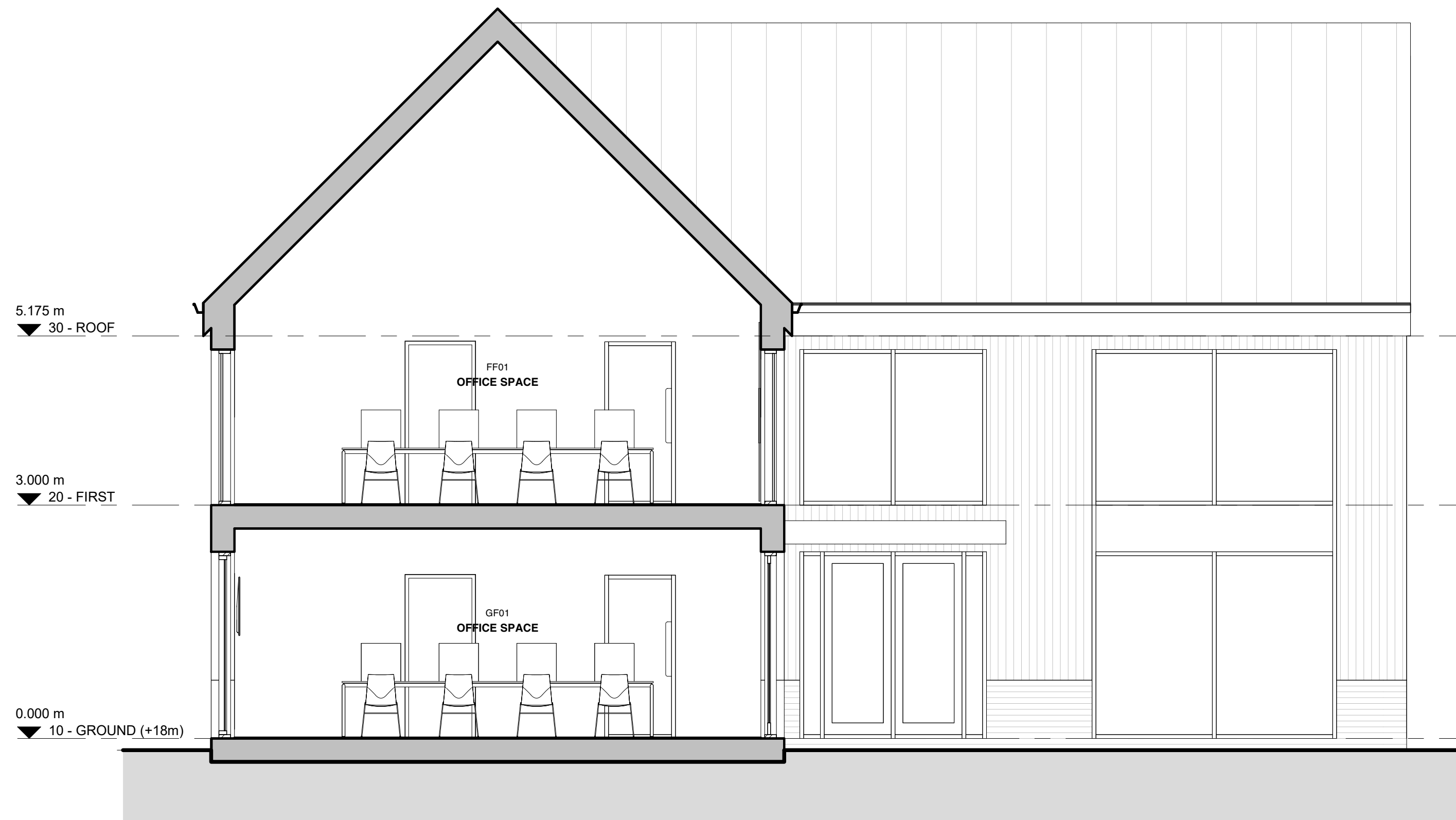
SECTION A-A - UNIT 01 1 : 50