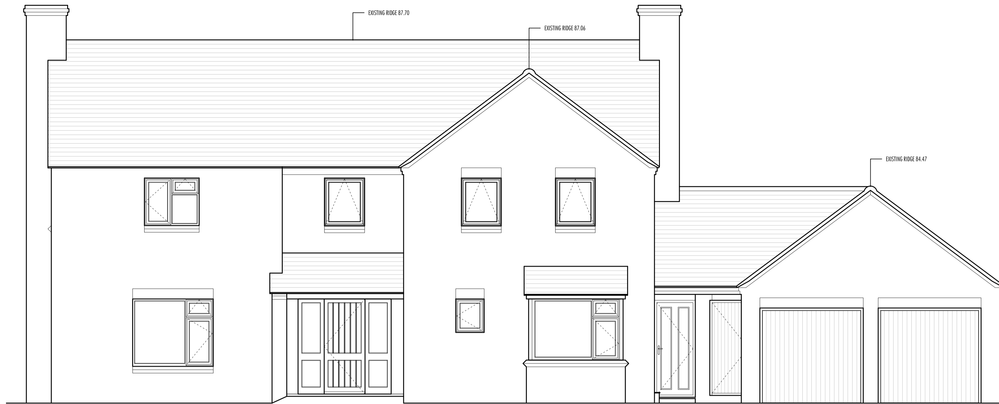
East Elevation [1:50]