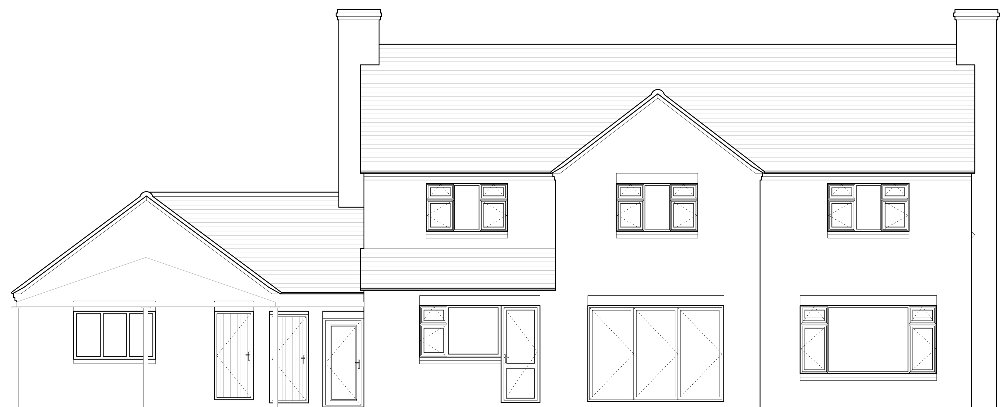
West Elevation [1:50]