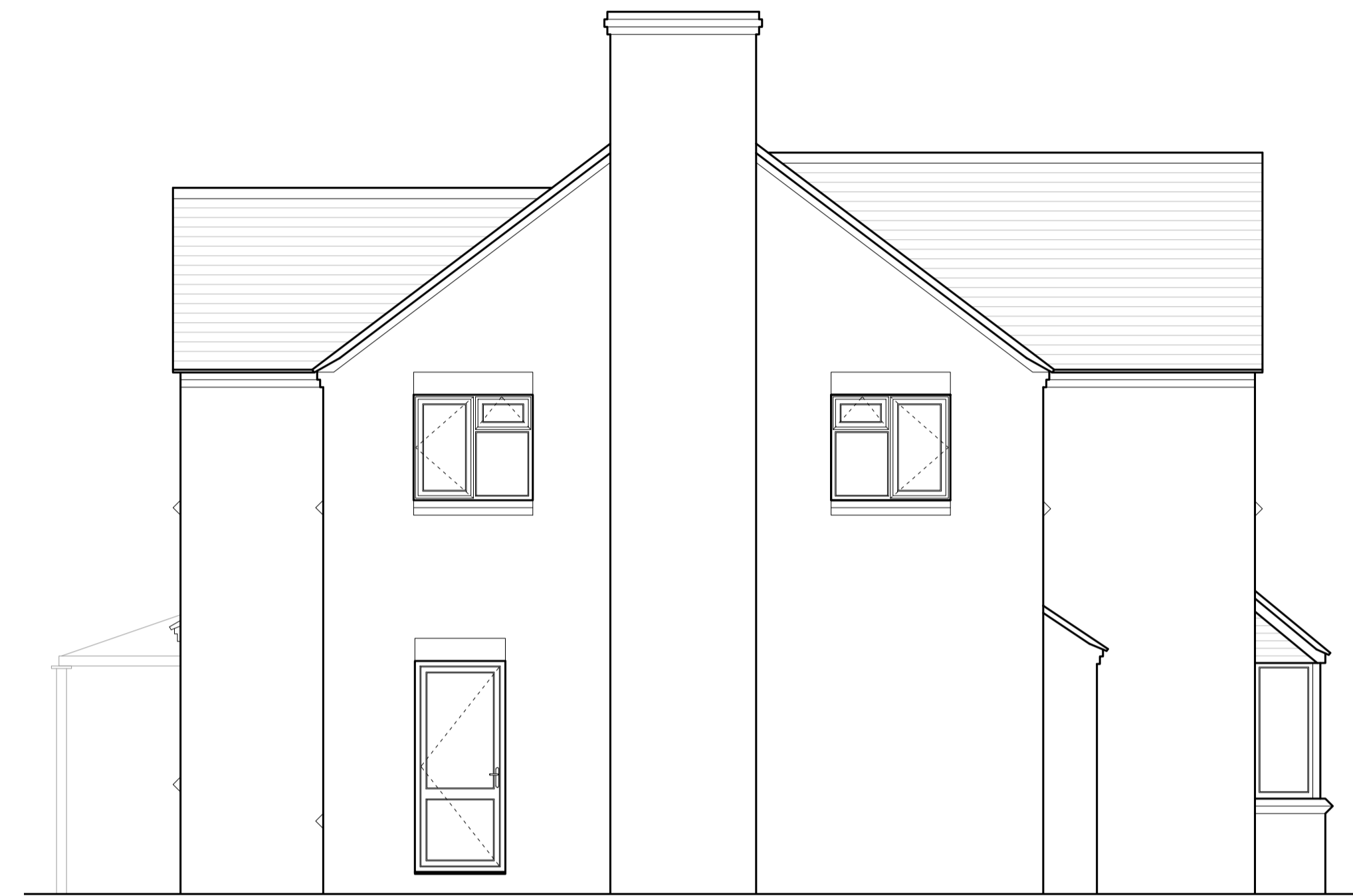
South Elevation [1:50]