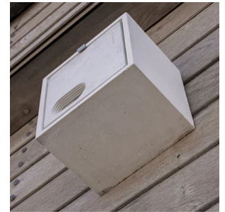
SWIFTBLOCK | SWIFT BOX from £70.00