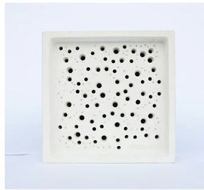
BEES BLOCK £49.00