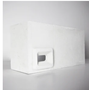
SWIFT BLOCK | SWIFT BOX - INTEGRATED £84.95