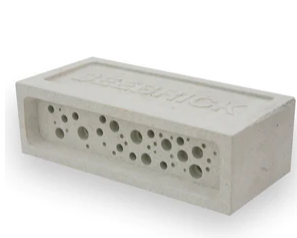
BEE BRICK® £32.00