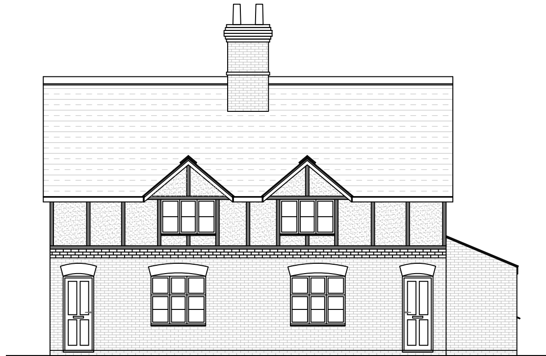
Existing East Elevation (1:100)