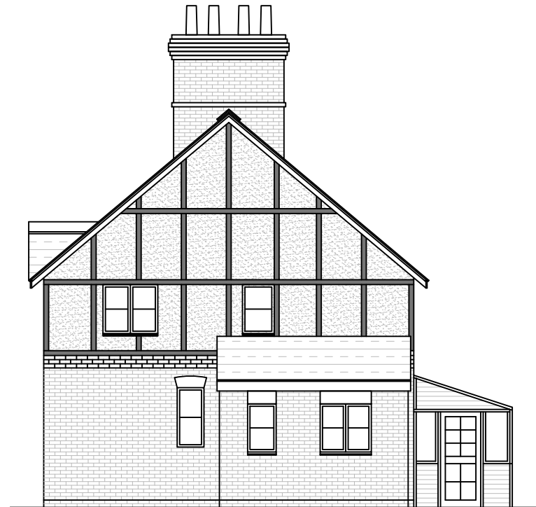
Existing North Elevation (1:100)

This drawing is not yet approved for Planning or Building Regulations, any works carried out prior to approvals is at the clients risk