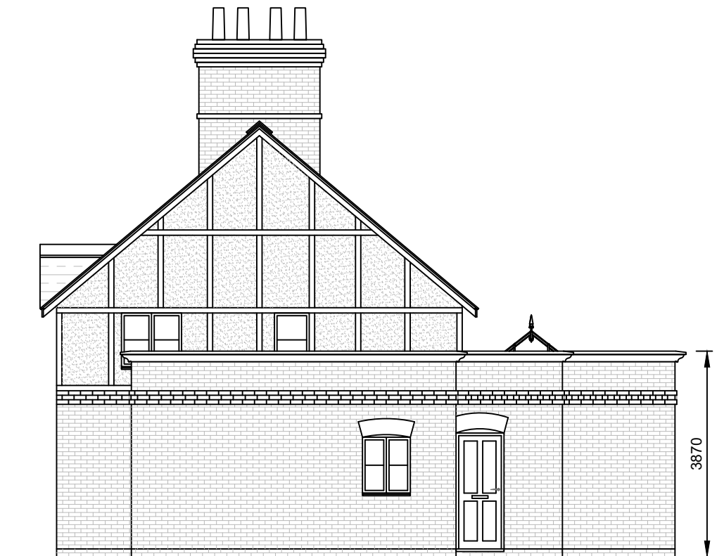
Proposed North Elevation (1:100)

This drawing is not yet approved for Planning or Building Regulations, any works carried out prior to approvals is at the clients risk