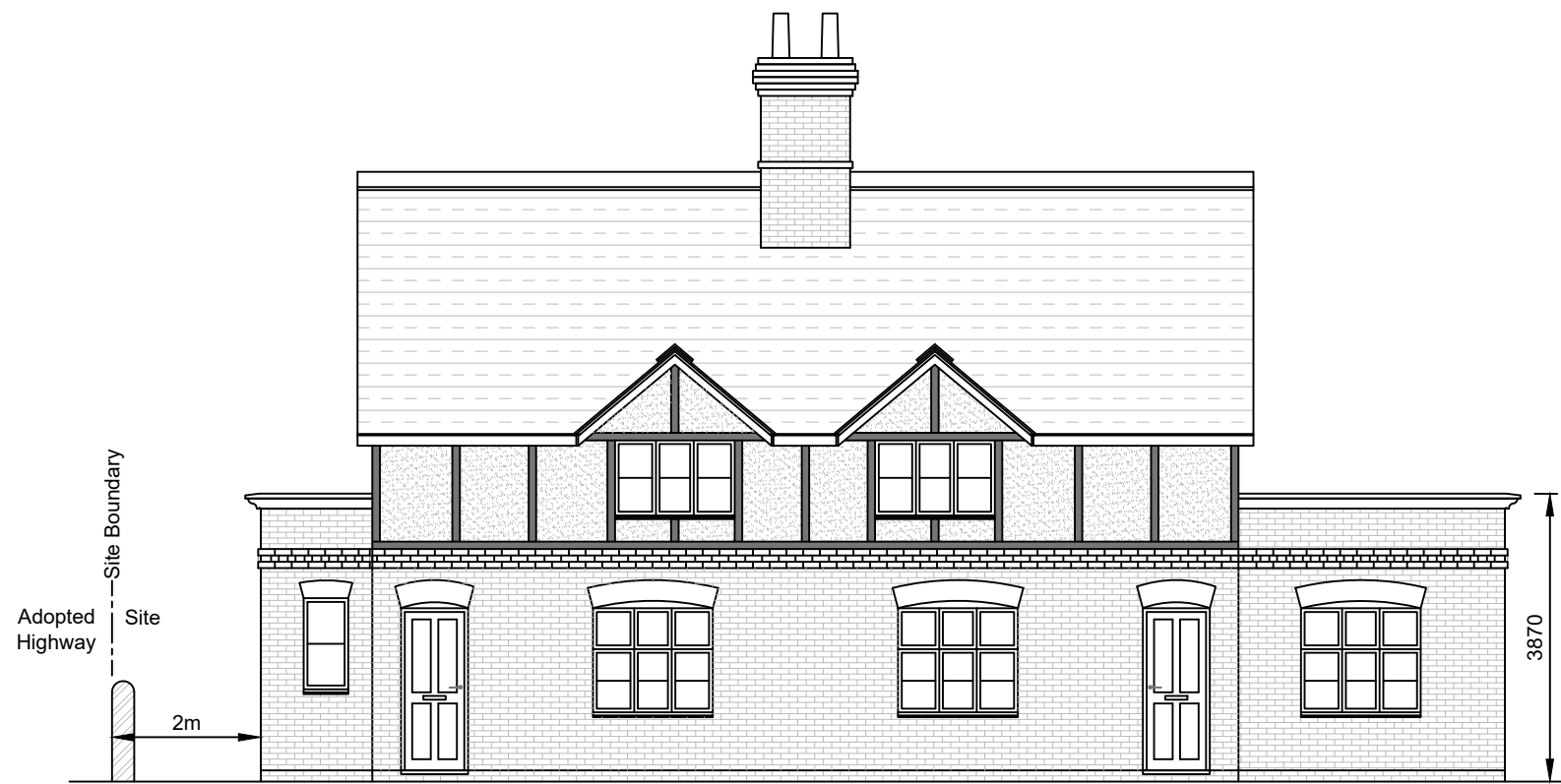
Proposed East Elevation (1:100)