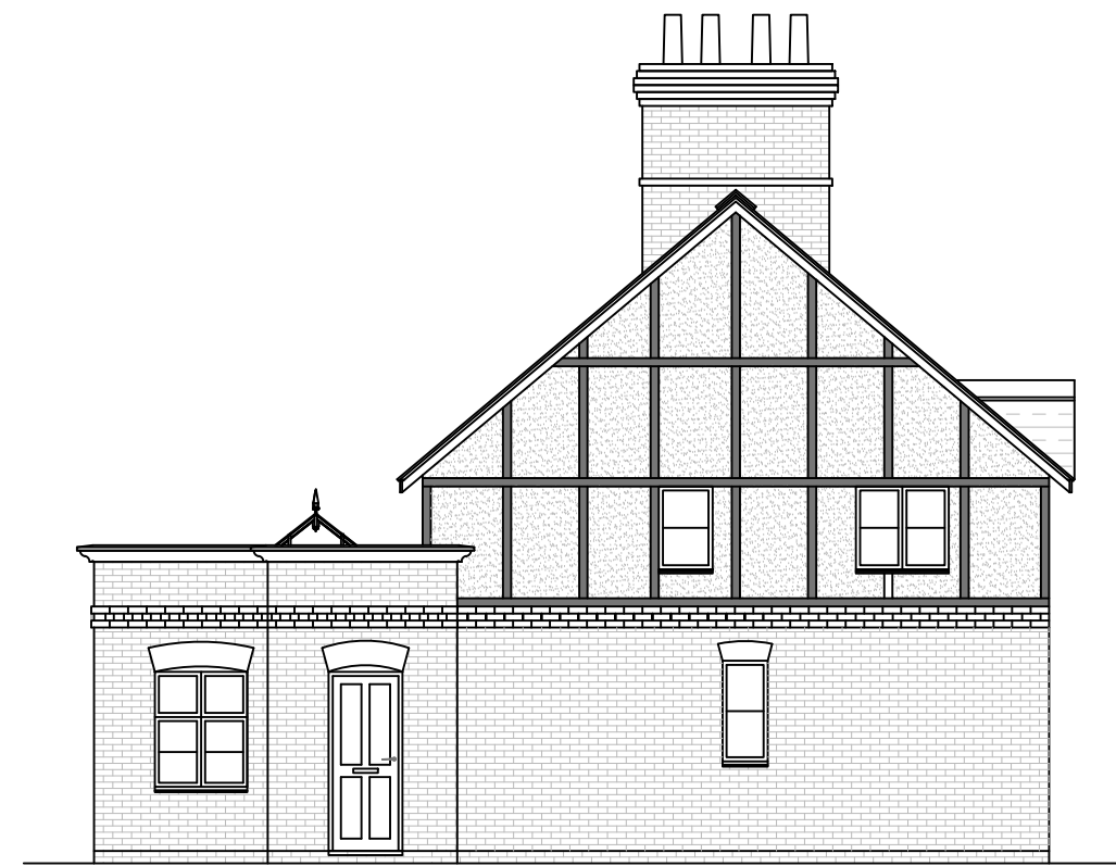
Proposed South Elevation (1:100)