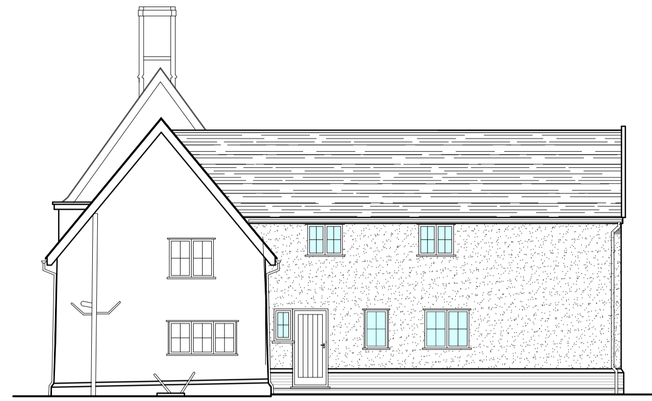
Side Elevation (North)