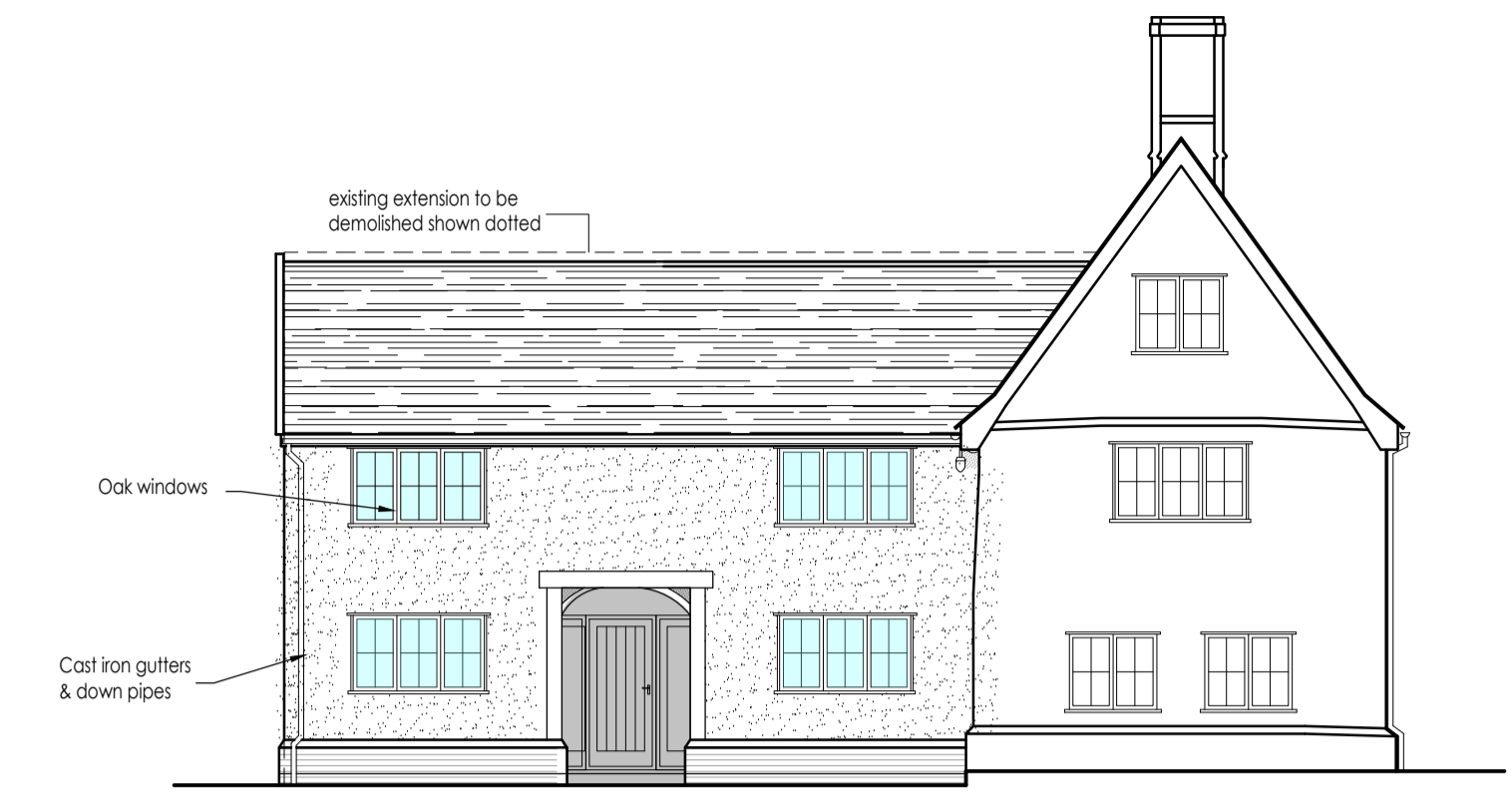
Side Elevation (South)