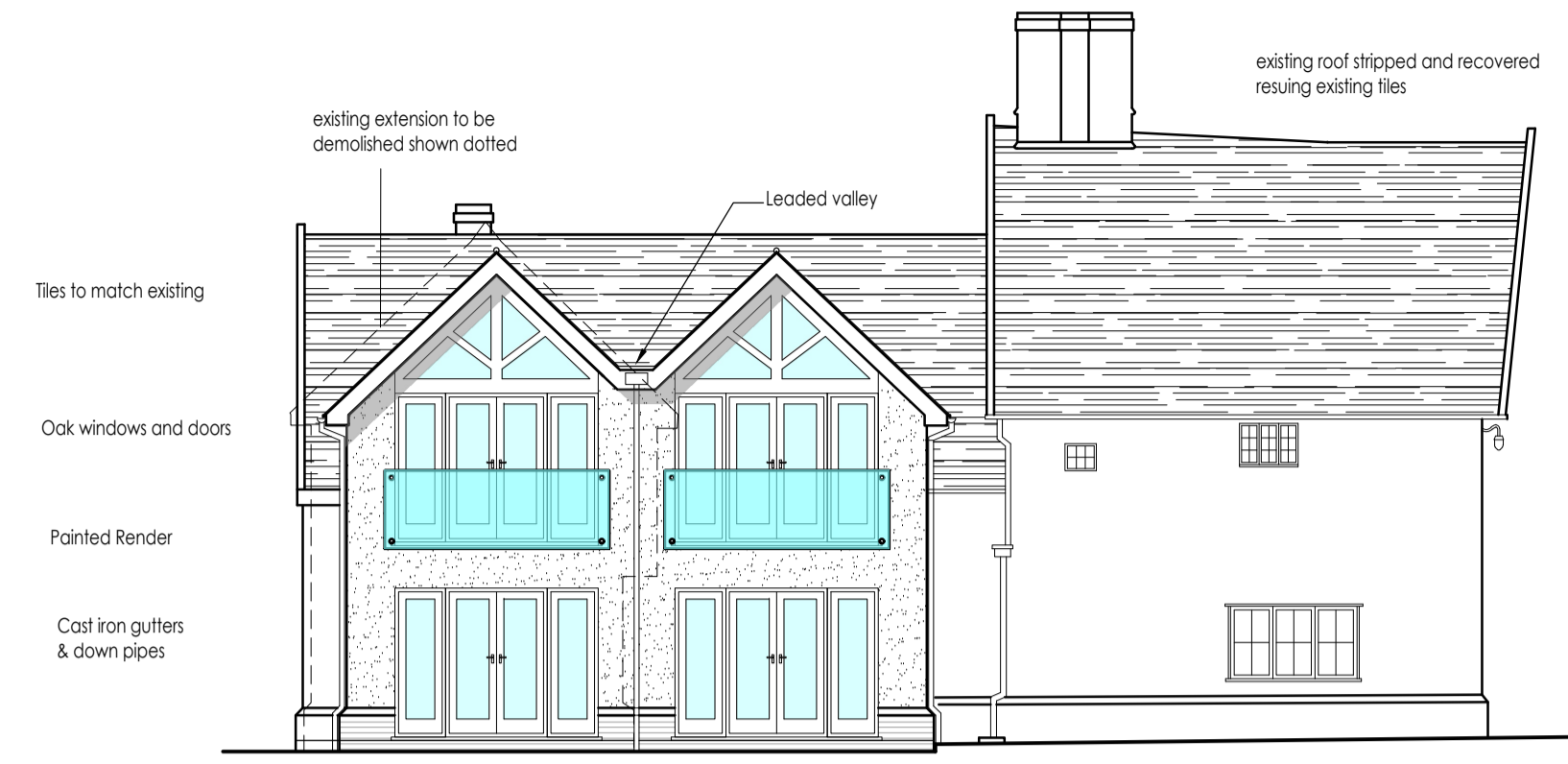
Rear Elevation (West)