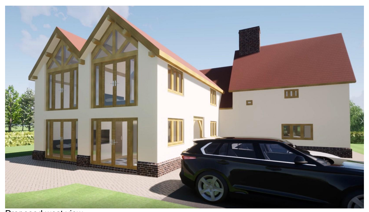
Proposed west view