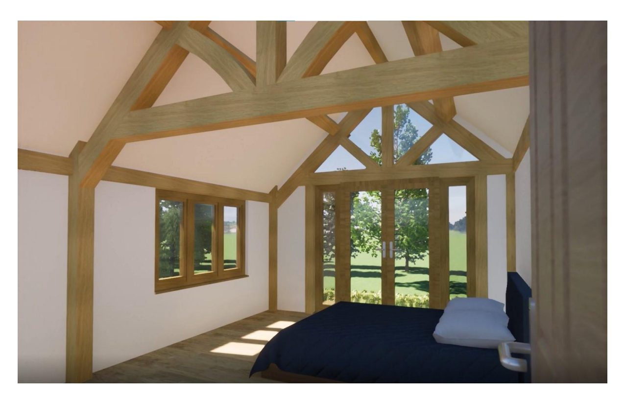
Proposed internal view, first floor