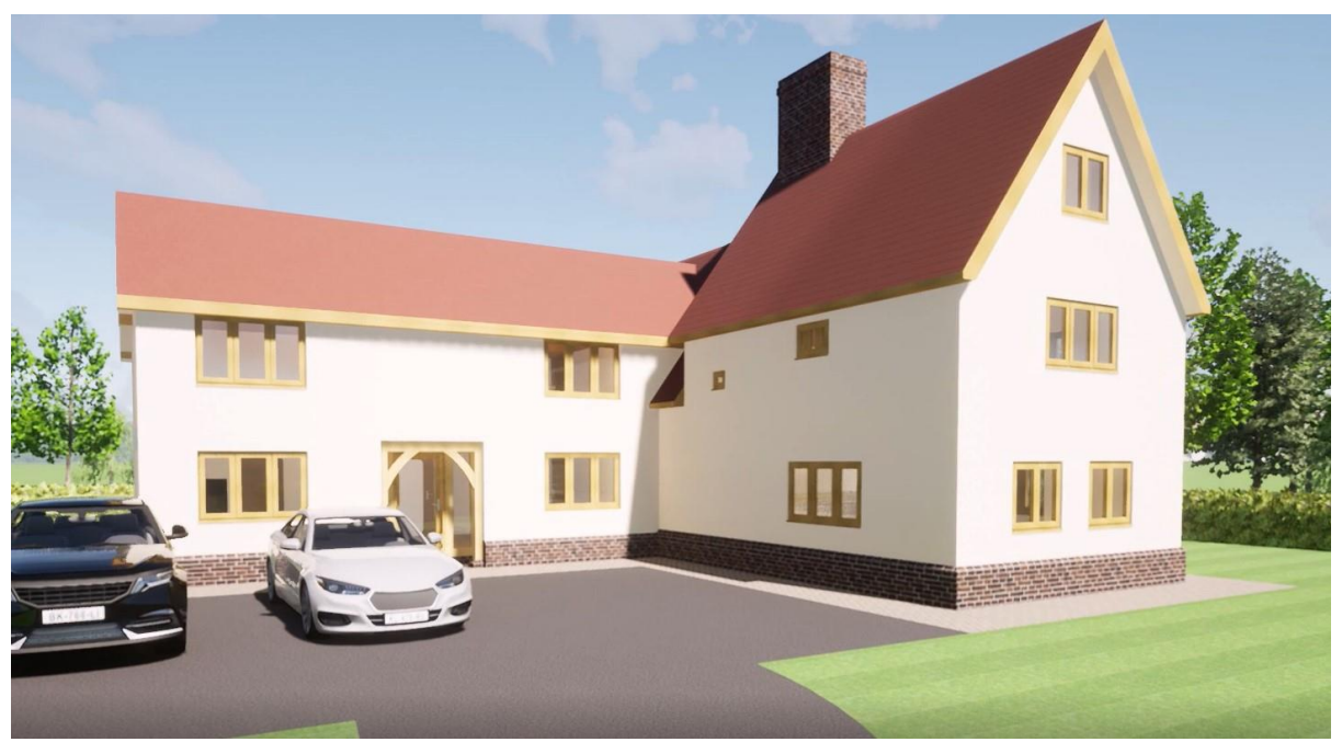
Proposed view from southwest